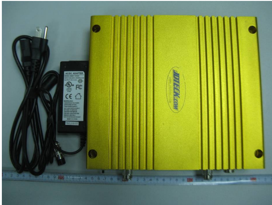
EUT – Top View