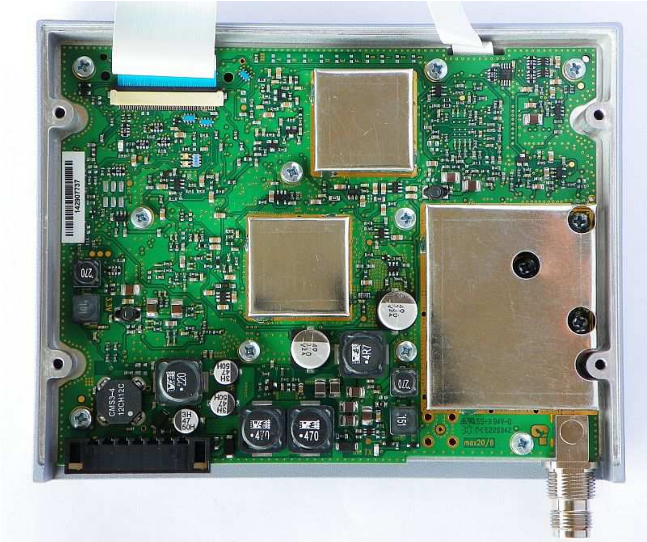
PHOTOGRAPH 1: Unit No. 4 top internal view