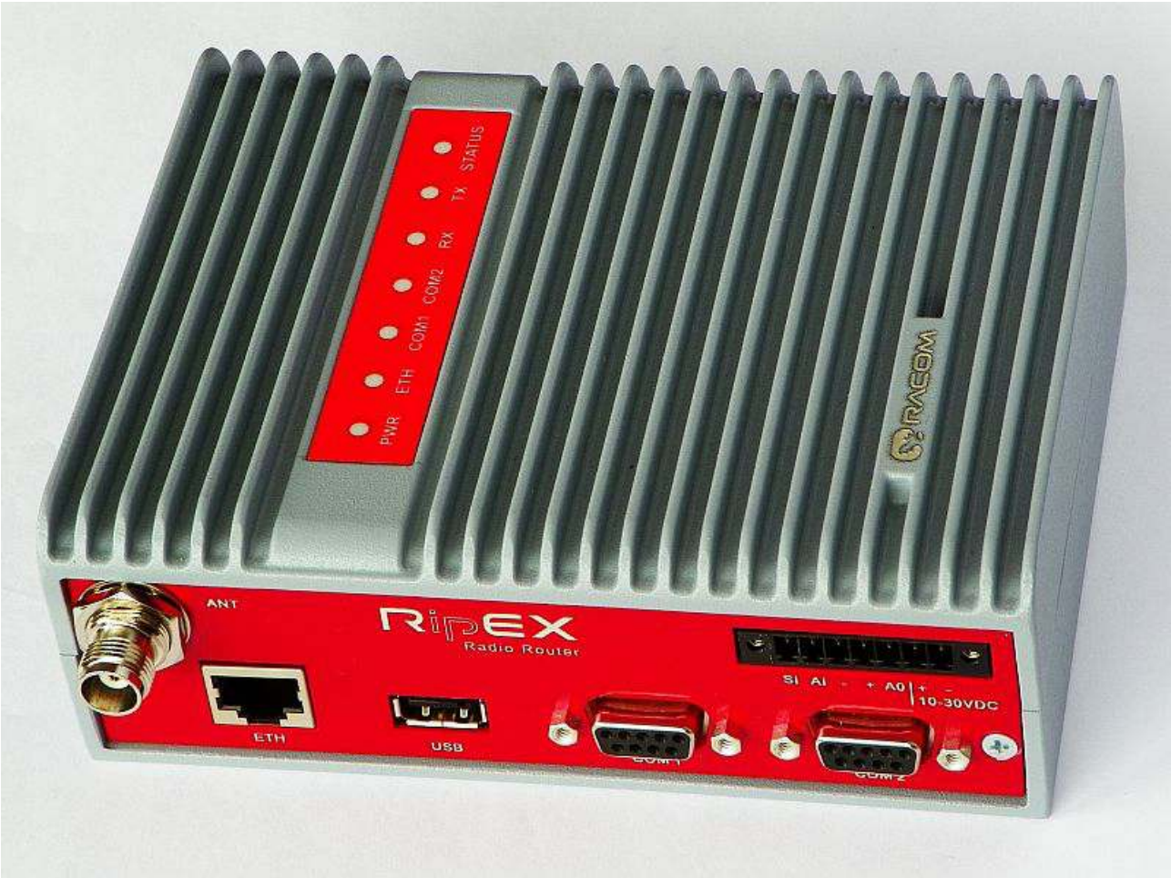
PHOTOGRAPH 1: Unit No. 1 external view