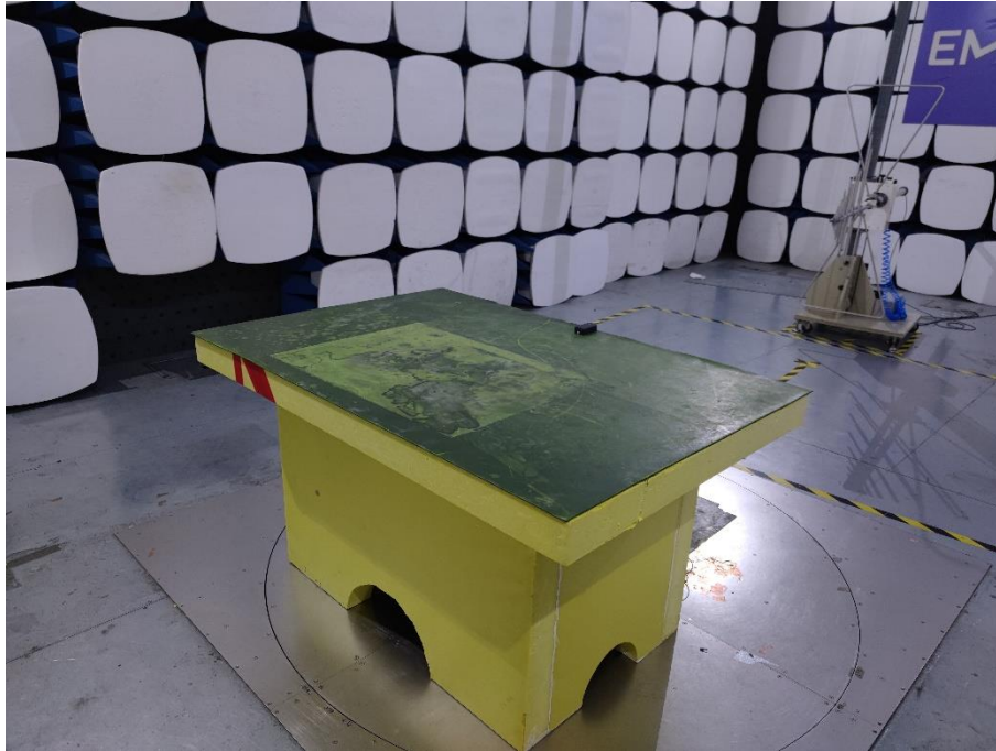
Back View (Below 1GHz)