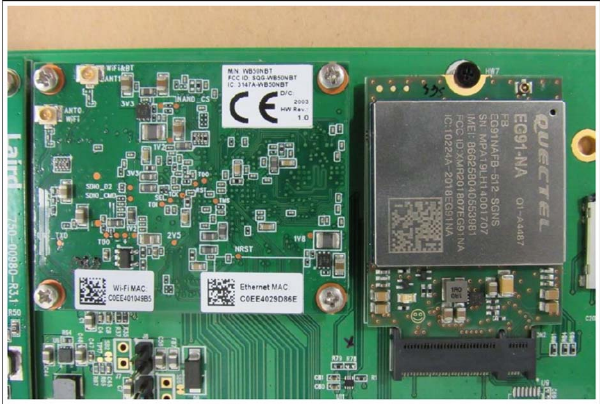
WiFi Module w/o shielding