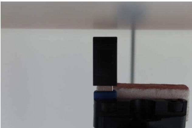
Tip Mode at 5 mm