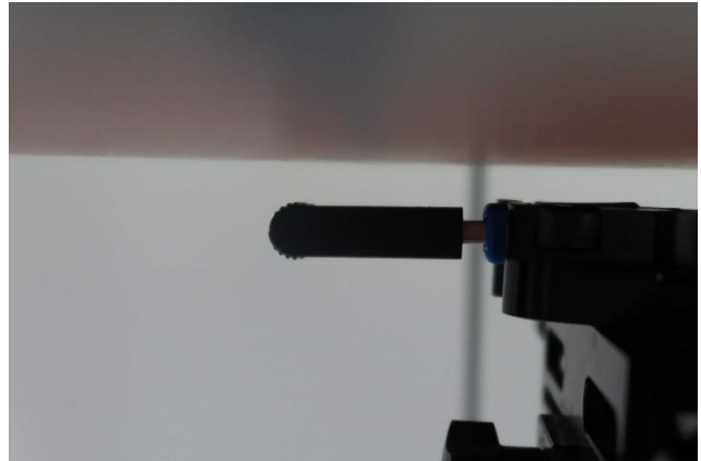
Horizontal Down at 5 mm