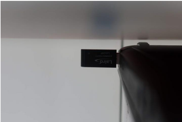
Vertical Front at 5 mm