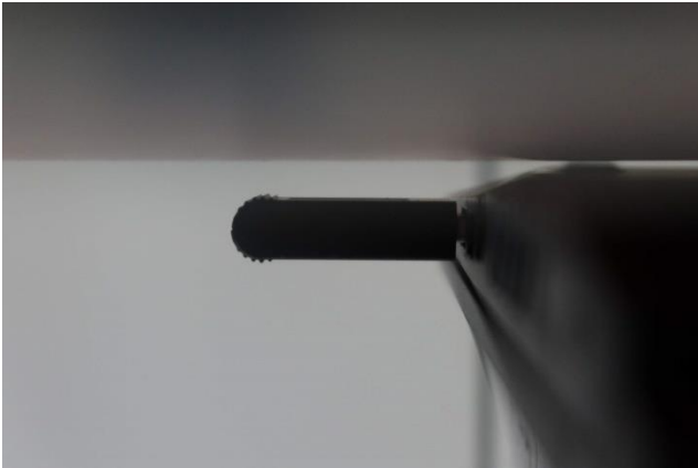
Horizontal Up at 5 mm