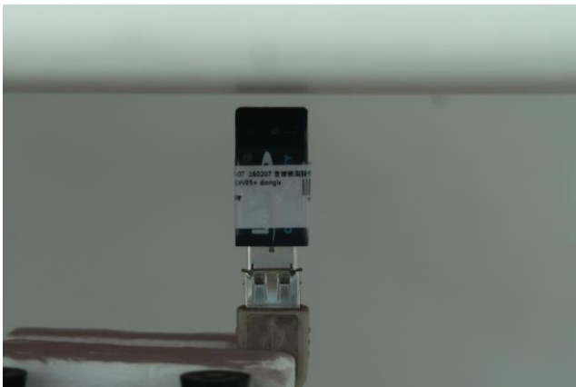
Tip Mode at 5 mm