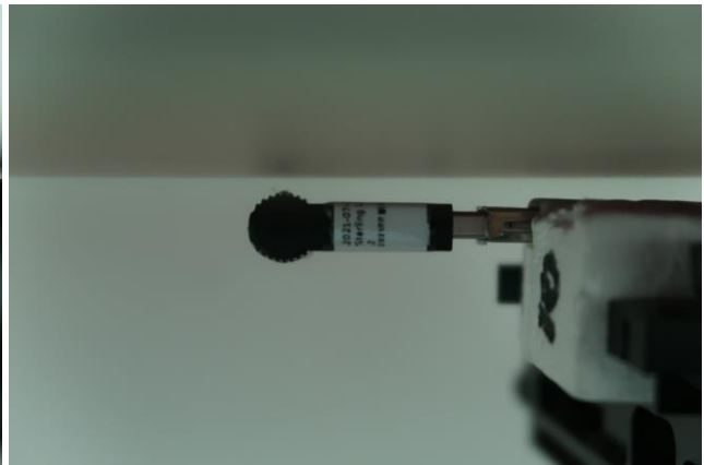
Horizontal Down at 5 mm