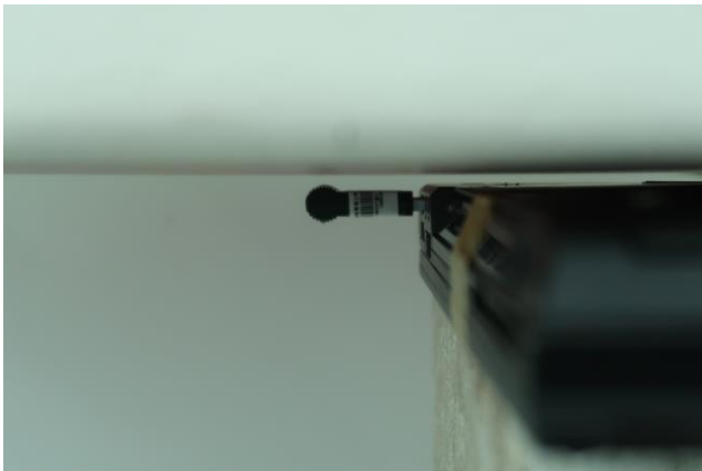
Horizontal Up at 5 mm