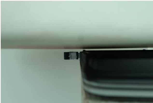
Vertical Front at 5 mm