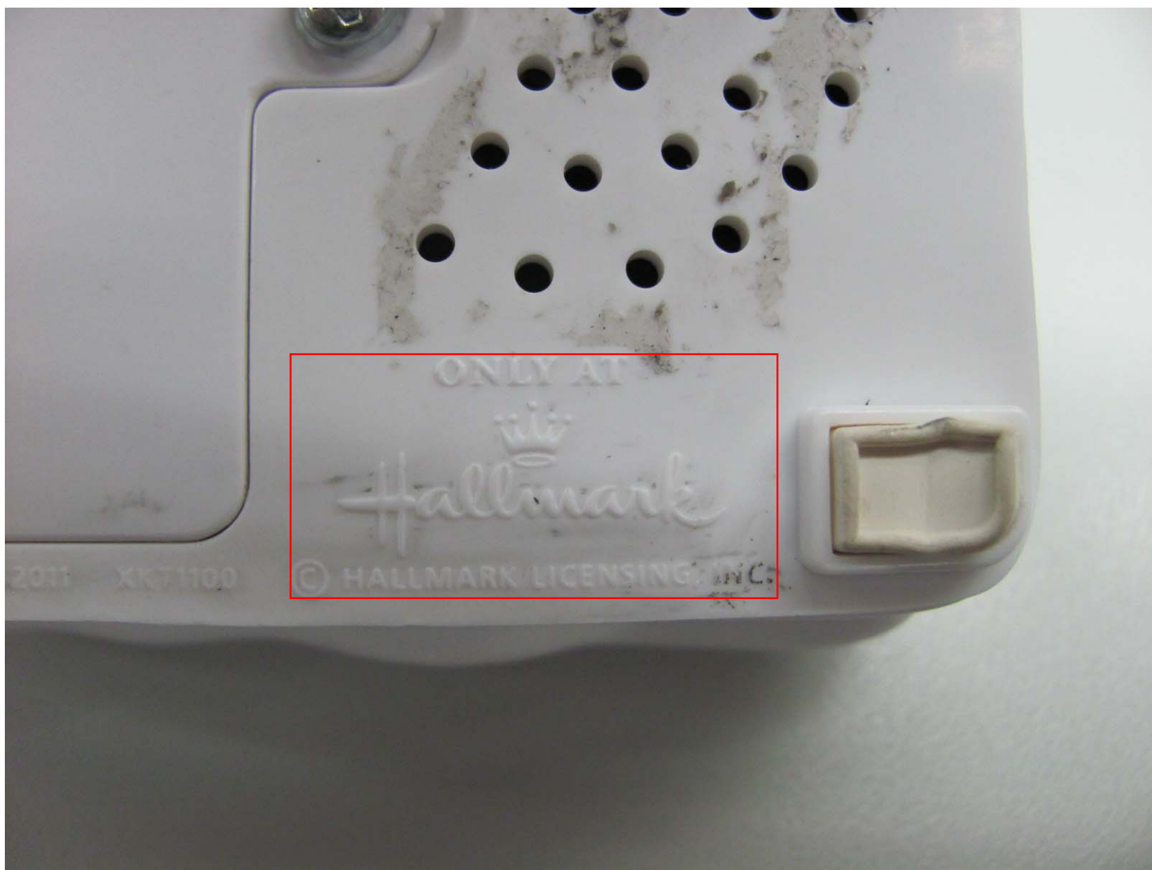
Size of Brand Name: 24mm X 12mm