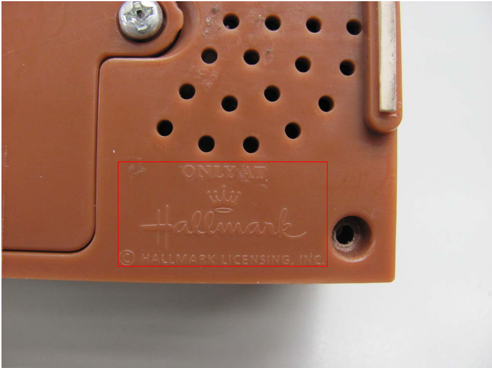
Size of Brand Name: 24mm X 12mm