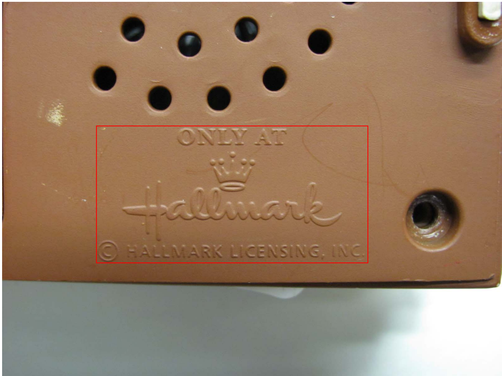
Size of Brand name: 24mm X 12mm