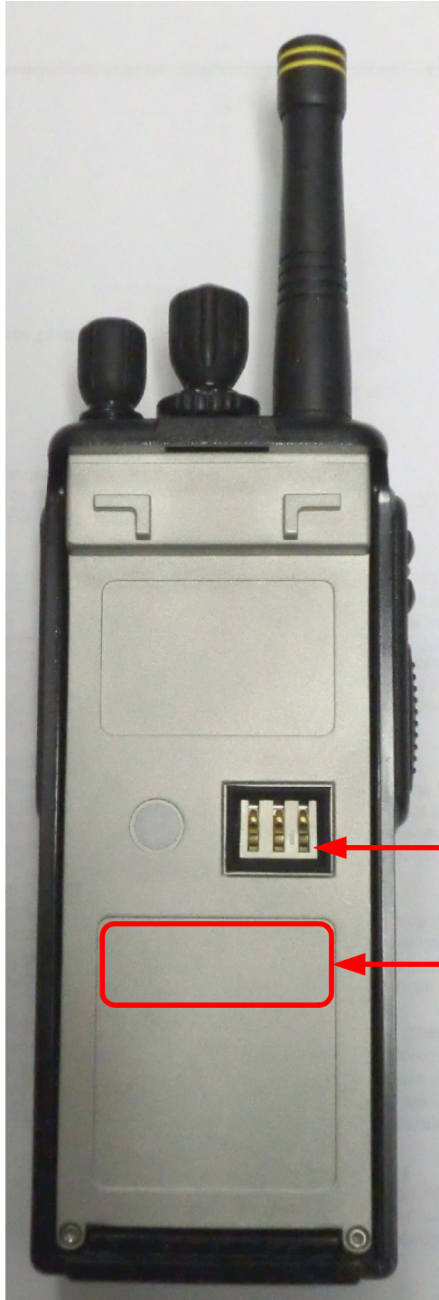
MMH Back View