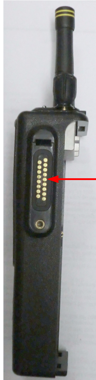
MMH Left View