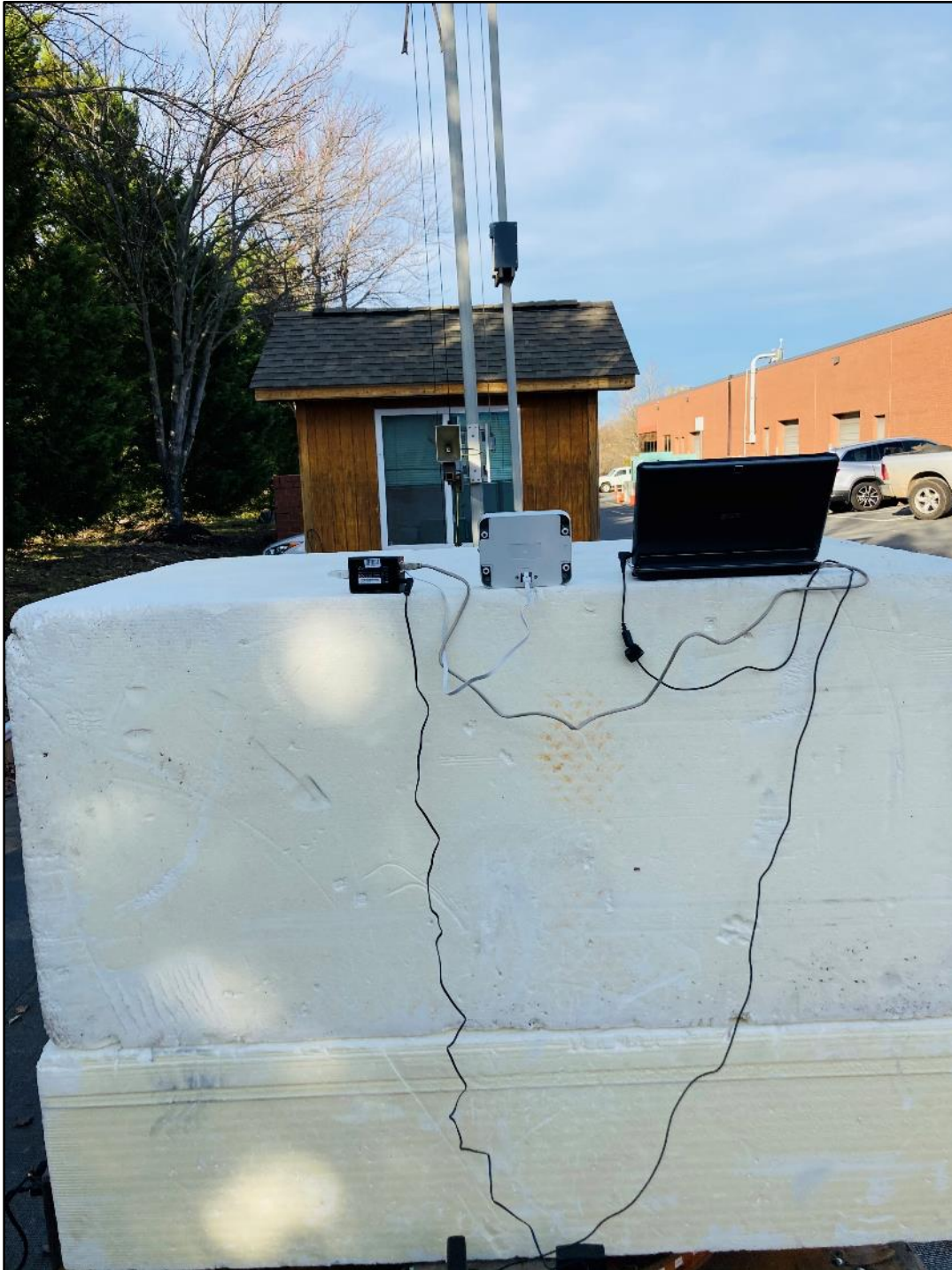
Photograph 4: Back View (Above 1 GHz)