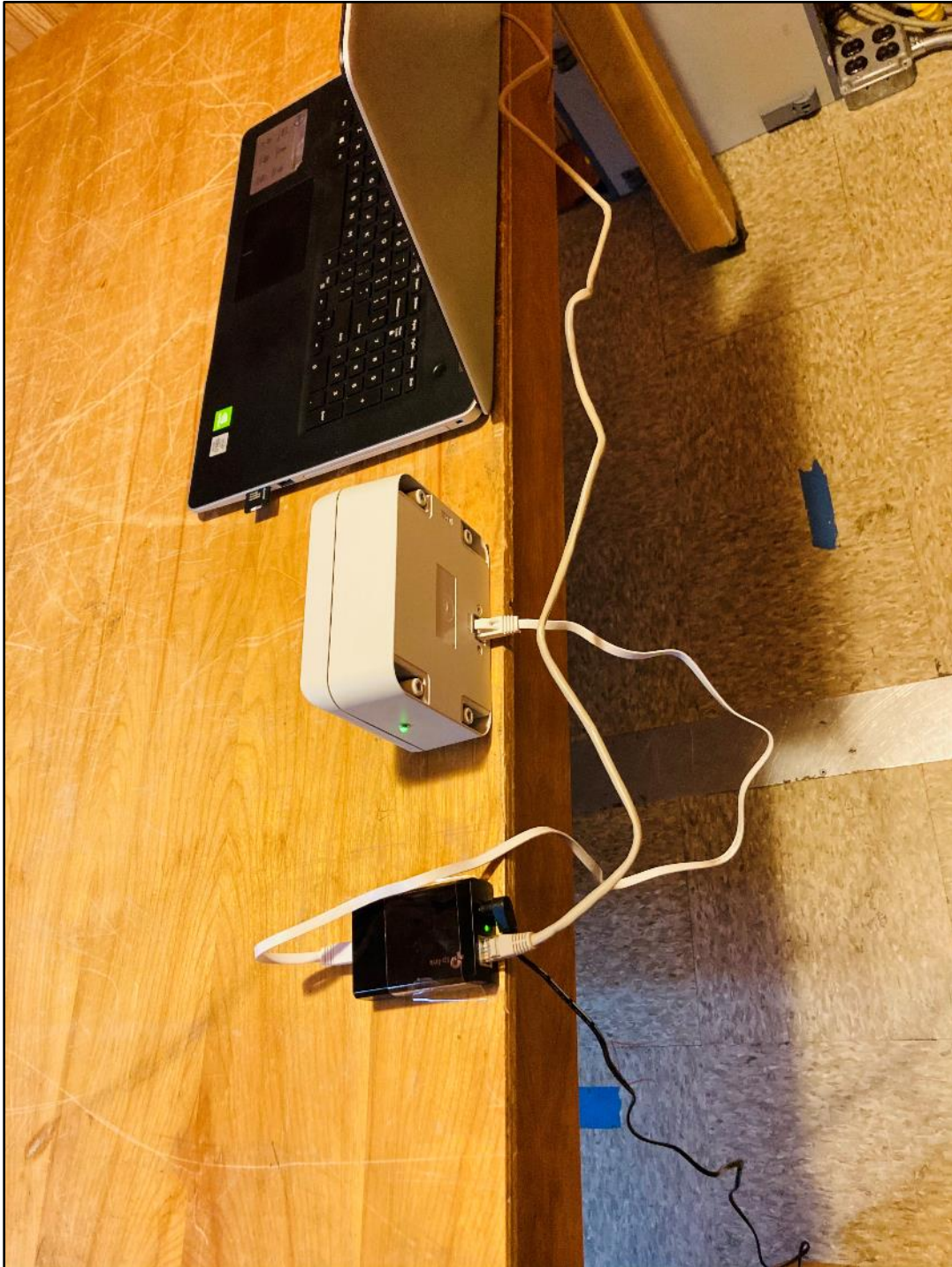
Photograph 6: AC Conducted Emissions - Back View