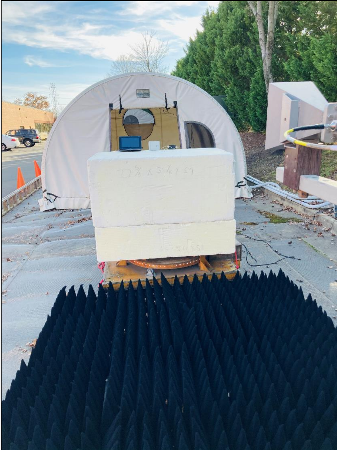
Photograph 3: Front View (Above 1 GHz)