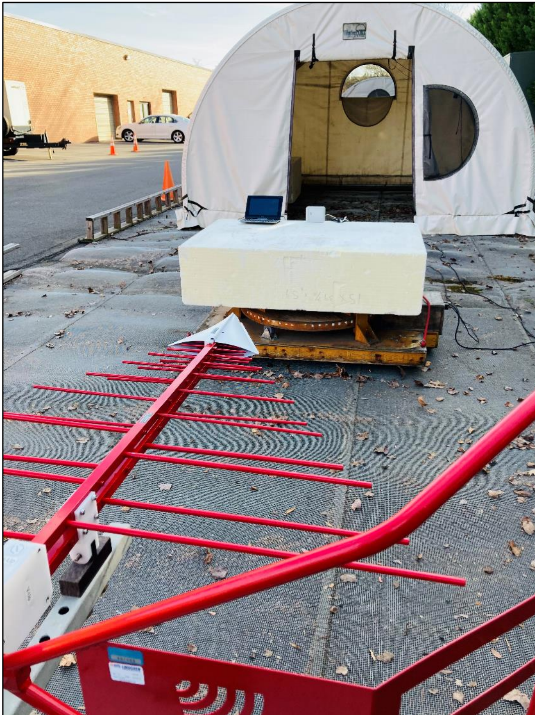
Photograph 1: Front View (Below 1 GHz)