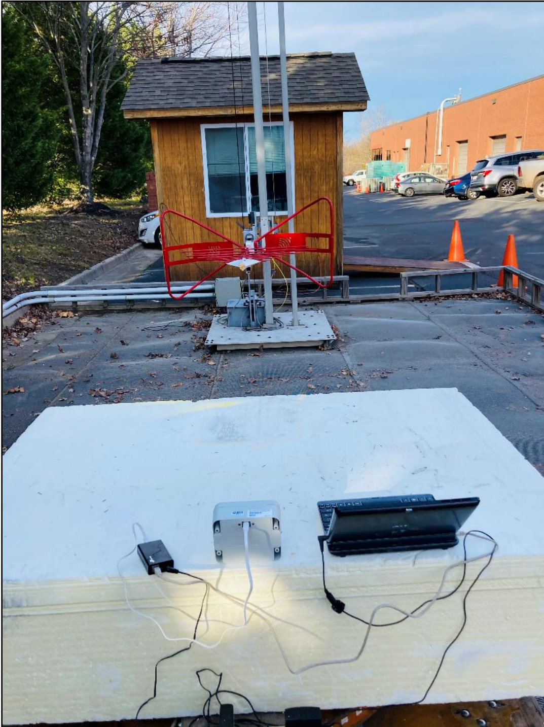
Photograph 2: Back View (Below 1 GHz)