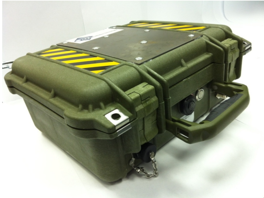
IWT PMN EXTERNAL WITH LID CLOSED