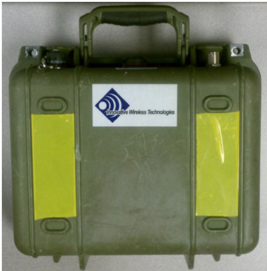
IWT PMN BOTTOM