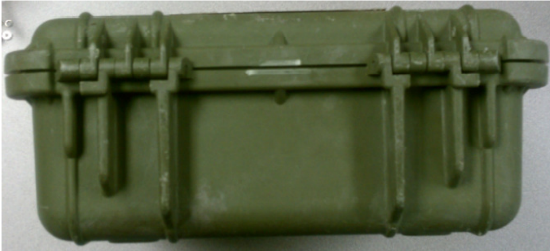
IWT PMN BACK