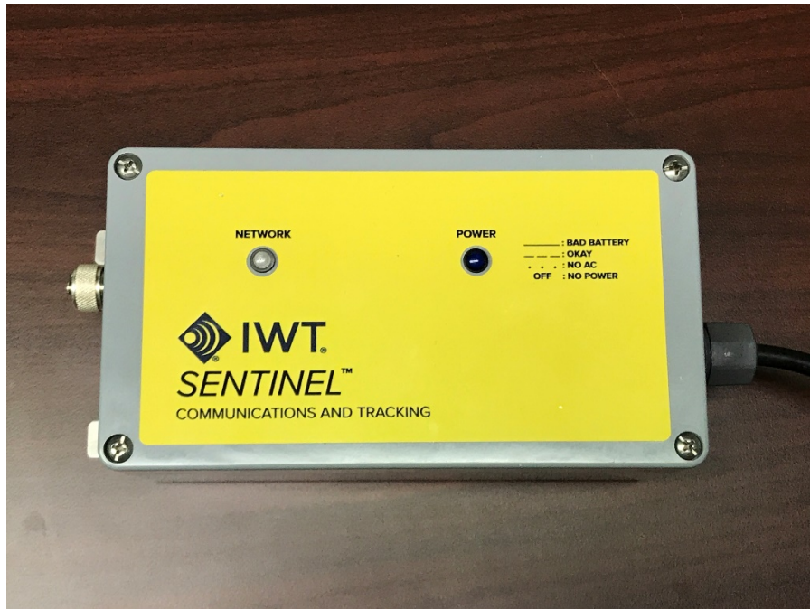
Figure 1 - Top View of IMN