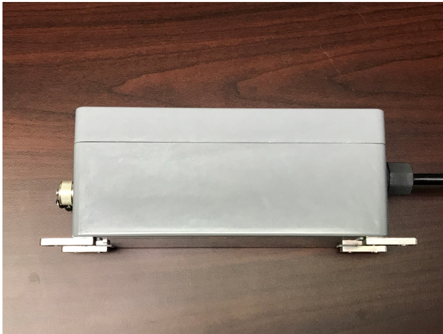
Figure 4 - Front View of IMN