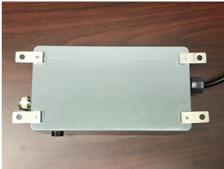
Figure 2 - Bottom View of IMN