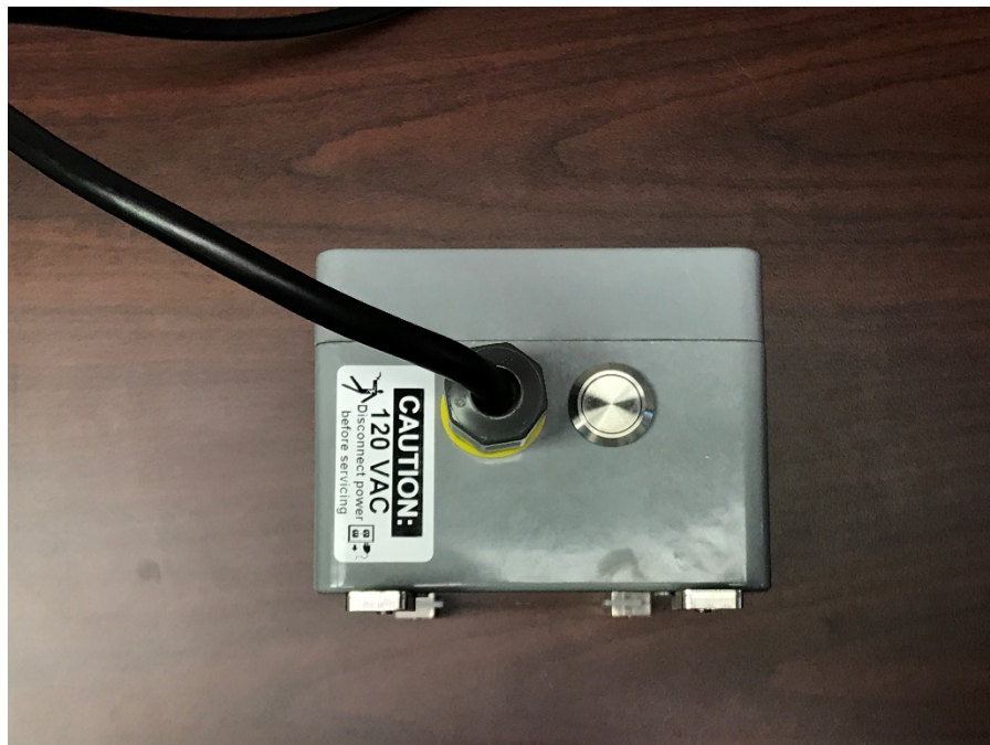
Figure 6 - Right Side View of IMN