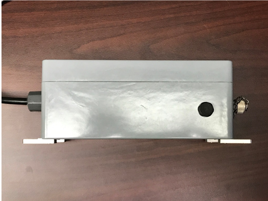
Figure 3 - Back View of IMN