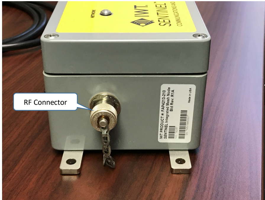
Figure 5 – Left View of IMN