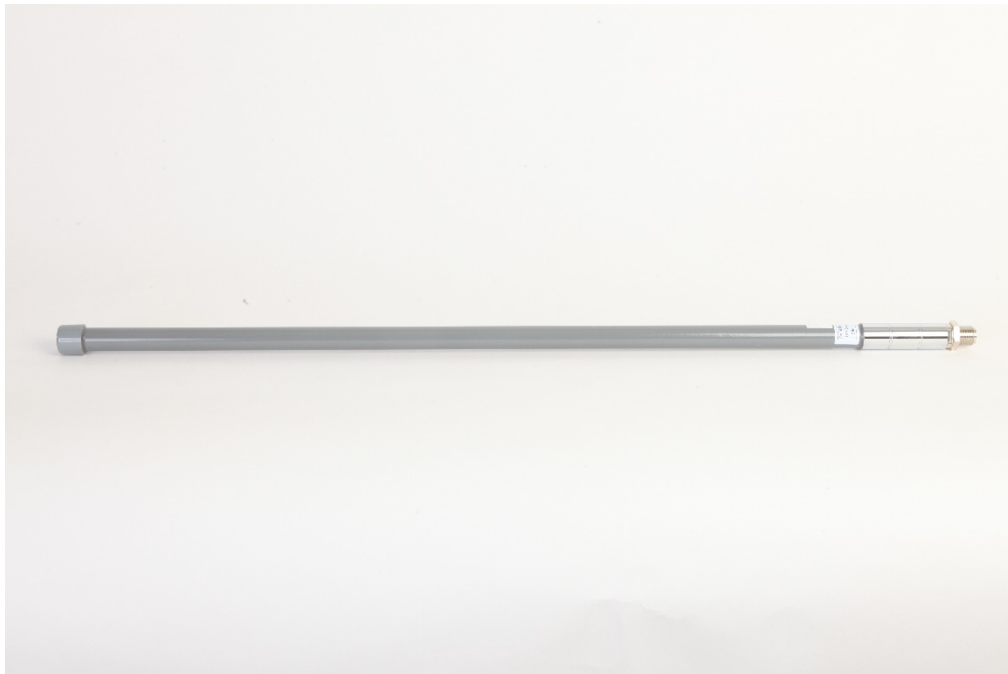
Figure 8 - Omni-directional dipole antenna