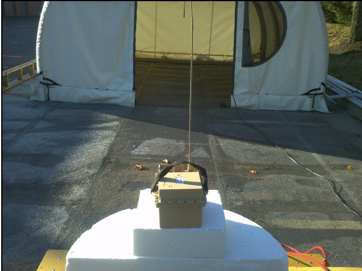
Photograph 1: Radiated Testing – Front View