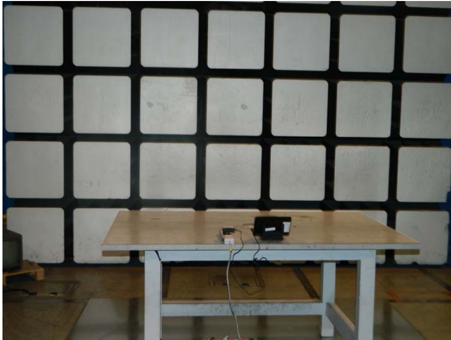
Conducted Measurement Photo