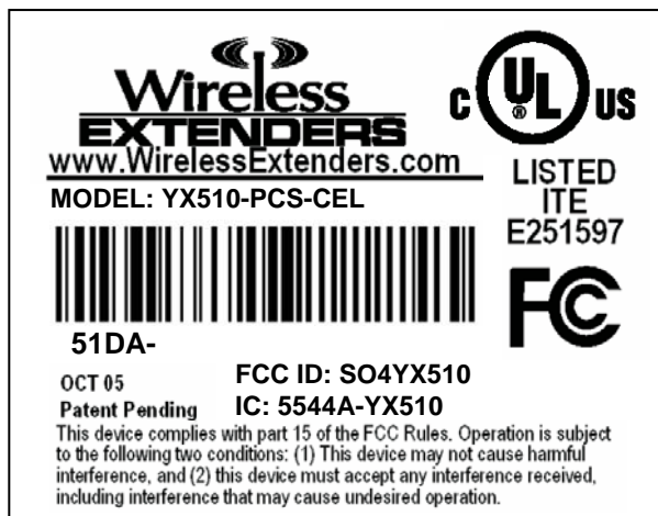
Figure 1: Label Information – Sample Label