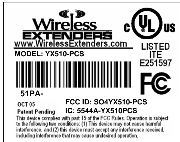
Figure 1: Label Information – Sample Label