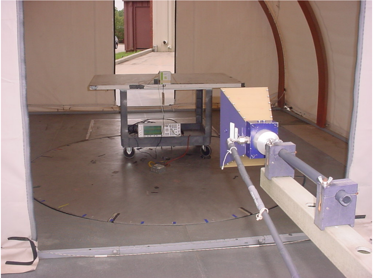
Figure 1: Radiated Emissions Test Setup