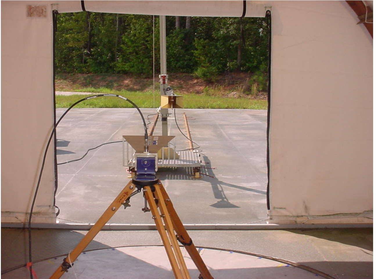
Figure 3: Radiated Emissions Test Setup – Substitution