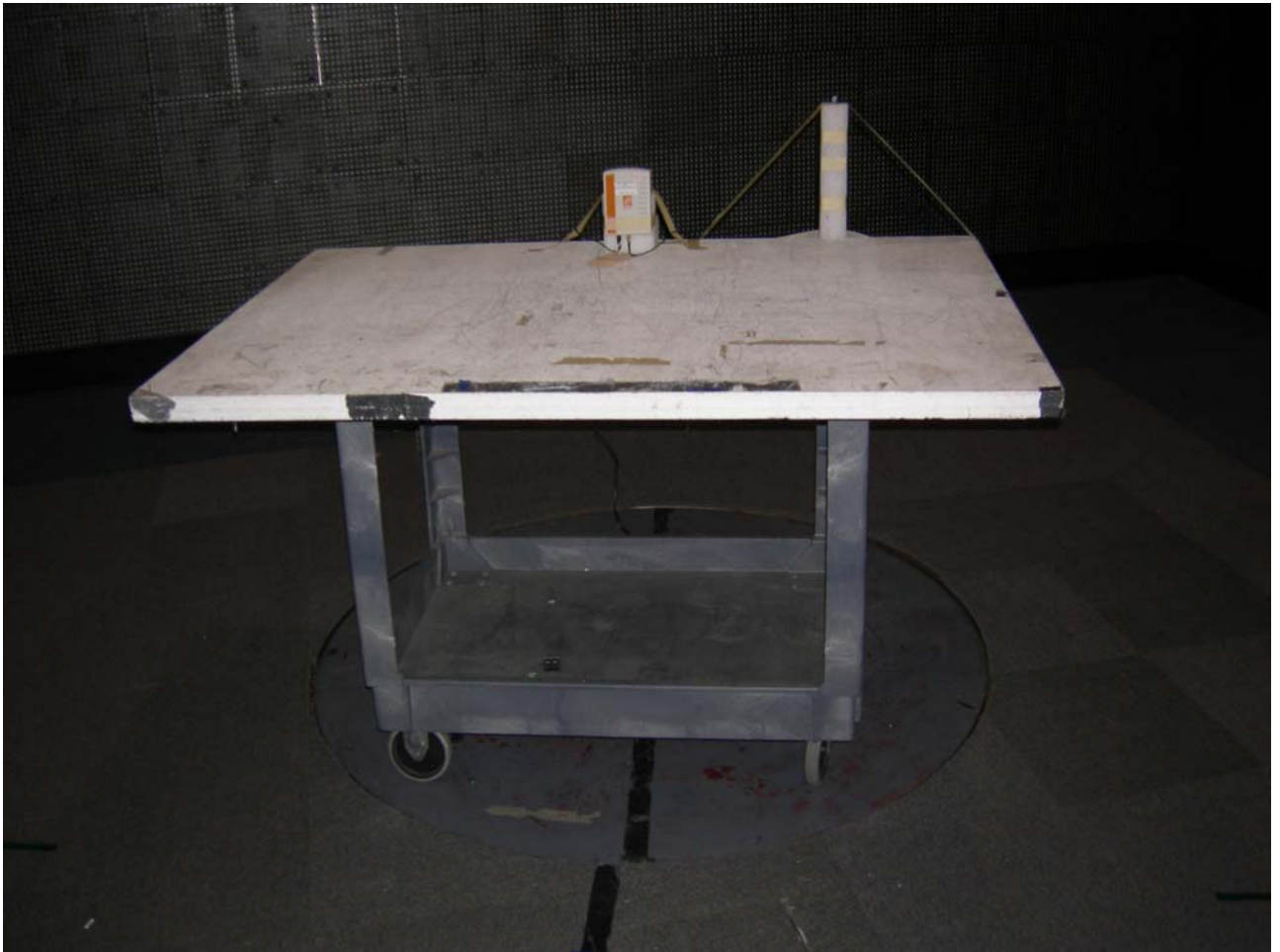
Figure 5: Unintentional Emissions Test Setup