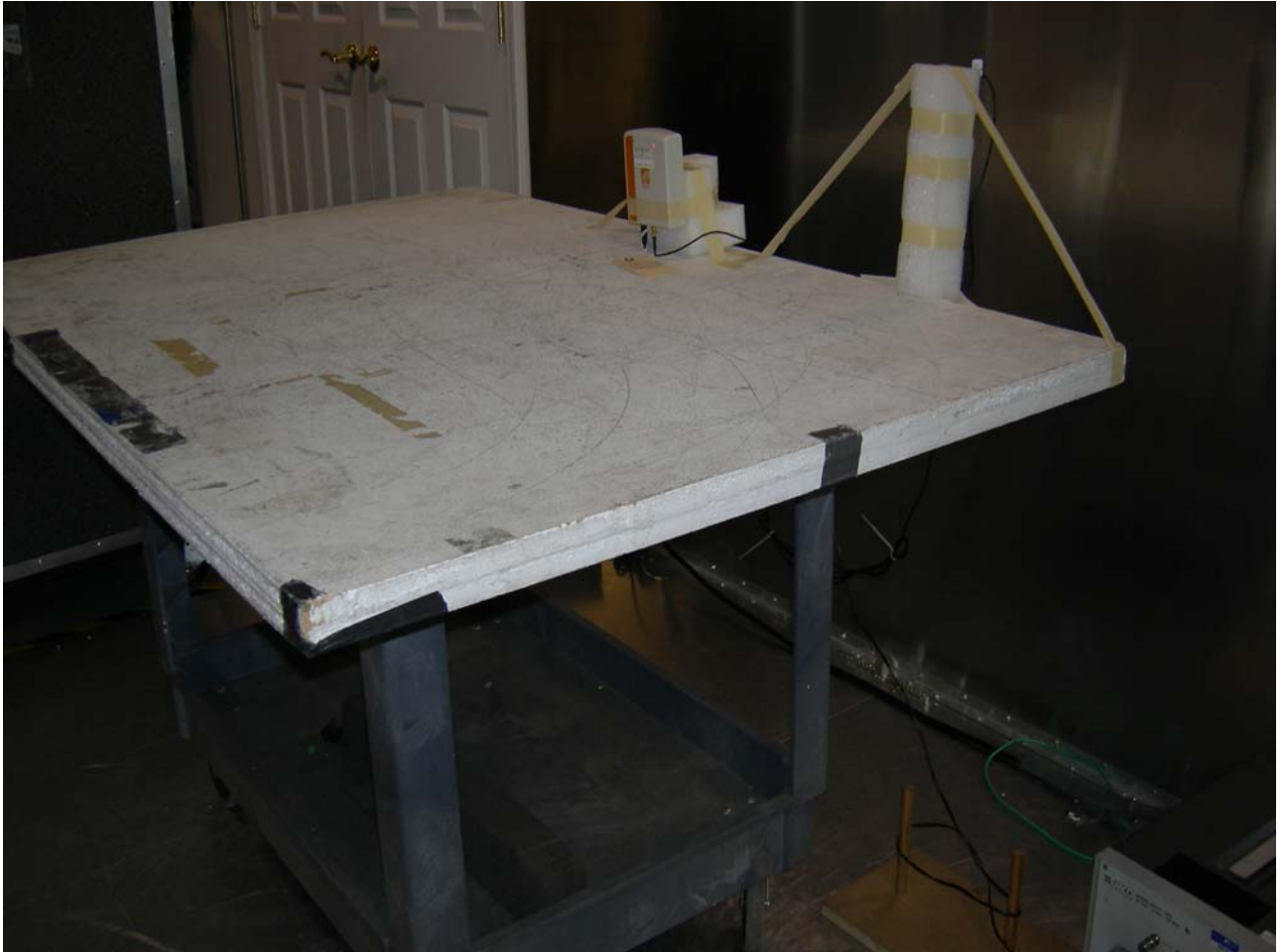
Figure 7: Conducted Emissions Test Setup