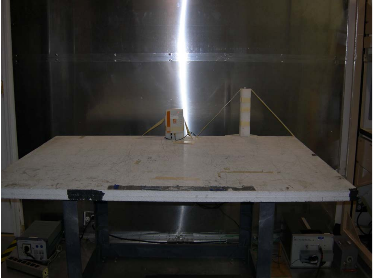
Figure 6: Conducted Emissions Test Setup