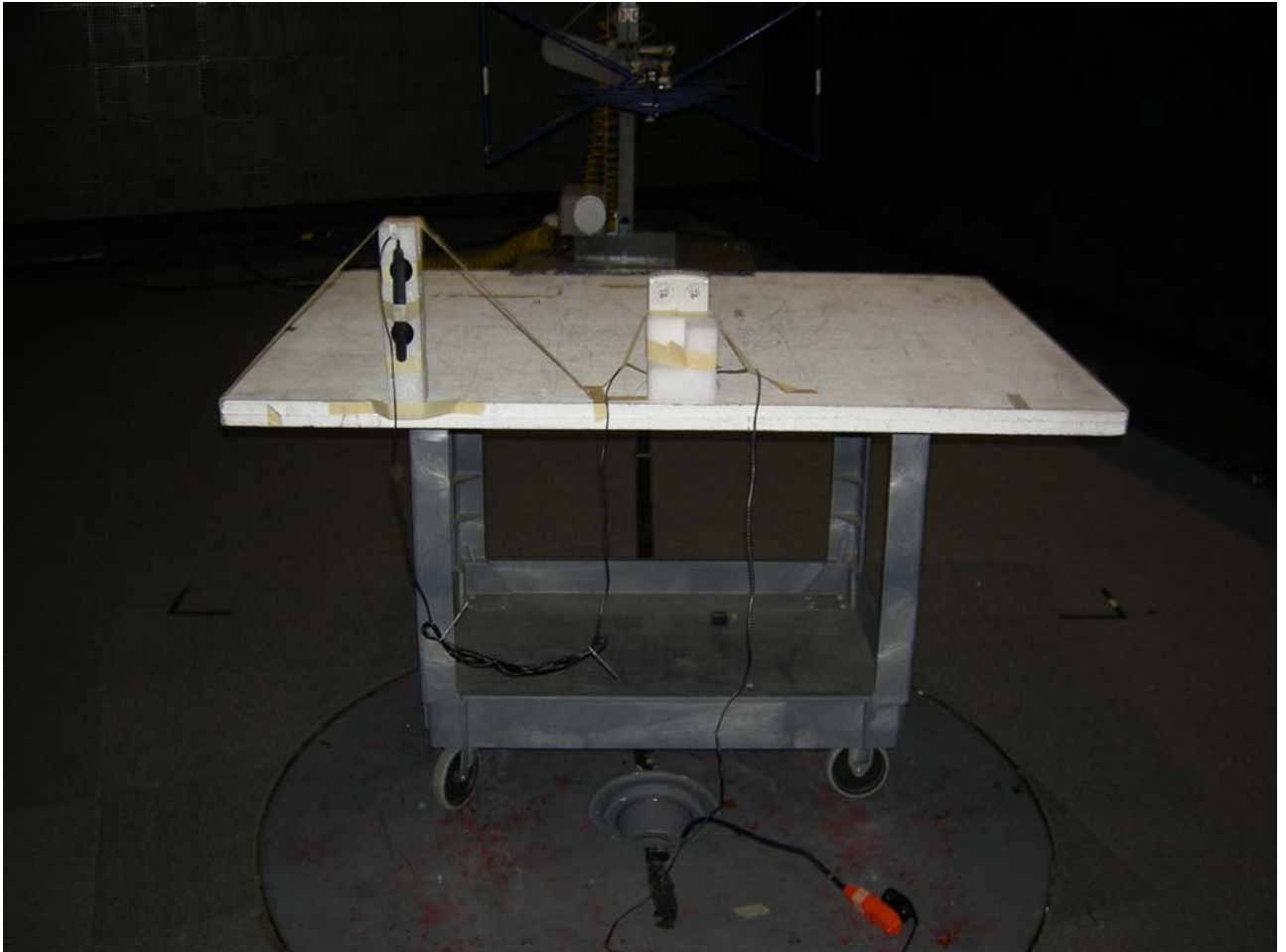
Figure 4: Unintentional Emissions Test Setup