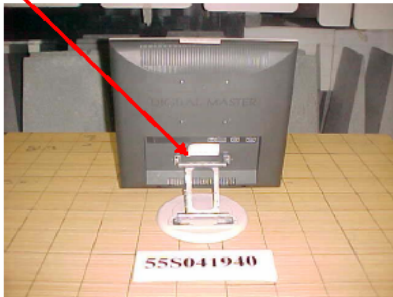
Physical Location Of Label On EUT