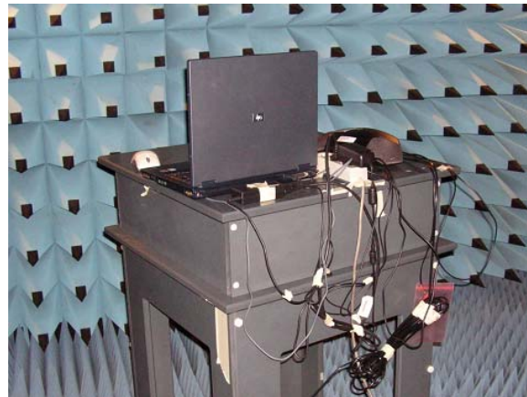
Spurious emission 1 – 10 GHz