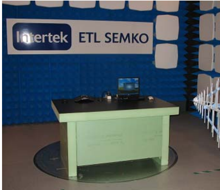
Spurious emission 30 – 1000 MHz