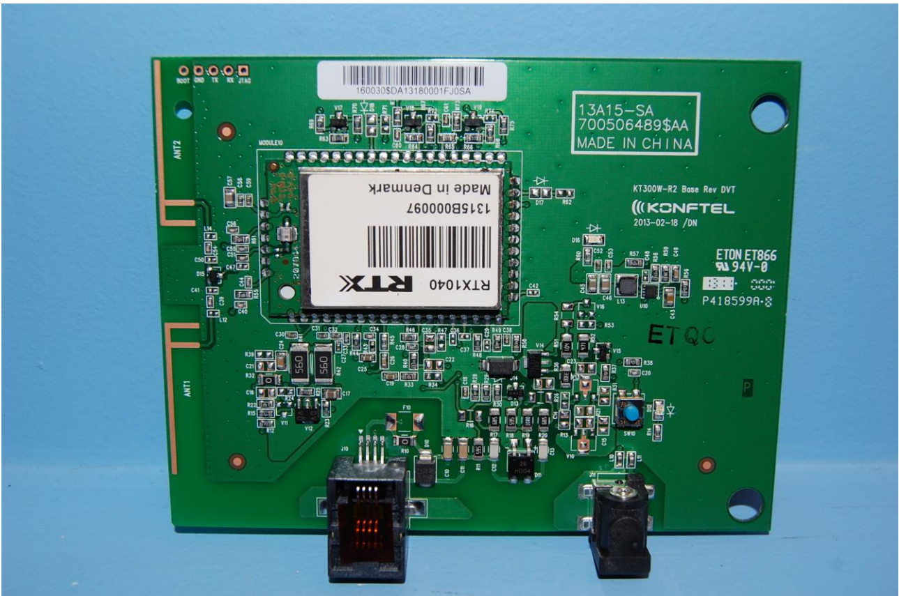
PCB top side