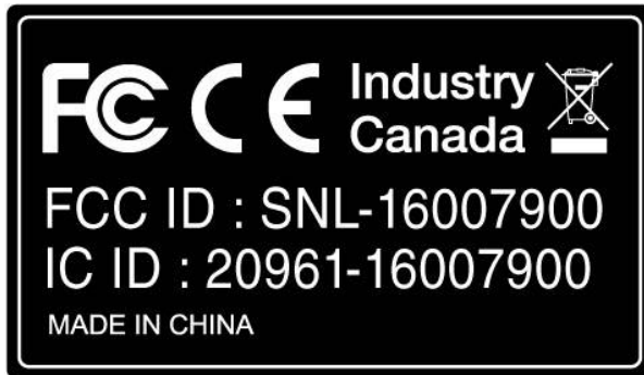
Label on the rear view