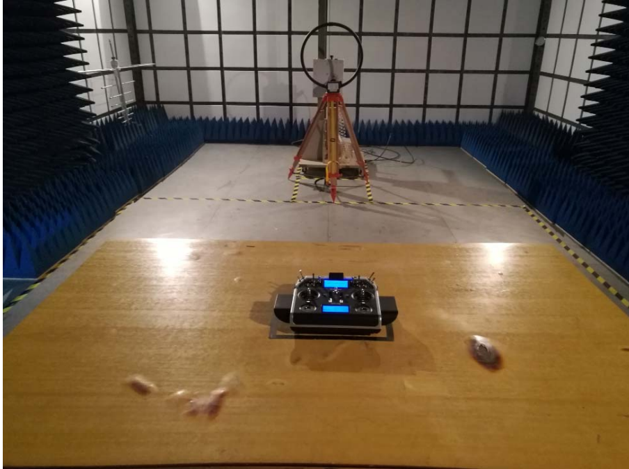
Radiated emission 30M~1G