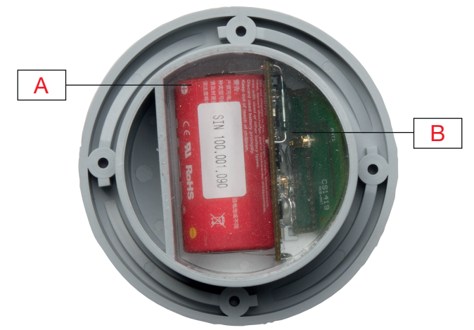
Fig. 1 Battery and LED