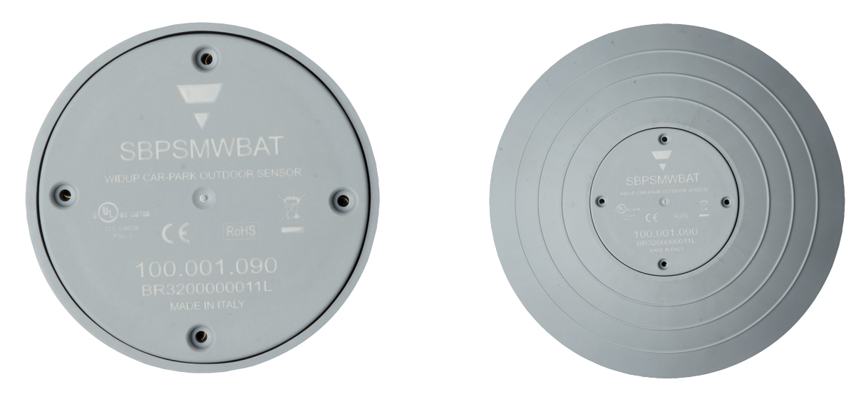
Fig. 2 SBPWSHA with SBPSMWBAT

The module can also be mounted with the surface-mounted base SBPWSHB. This installation is more accessible as the base just needs to be glued to the surface of the parking space. See fig. 2 and 3