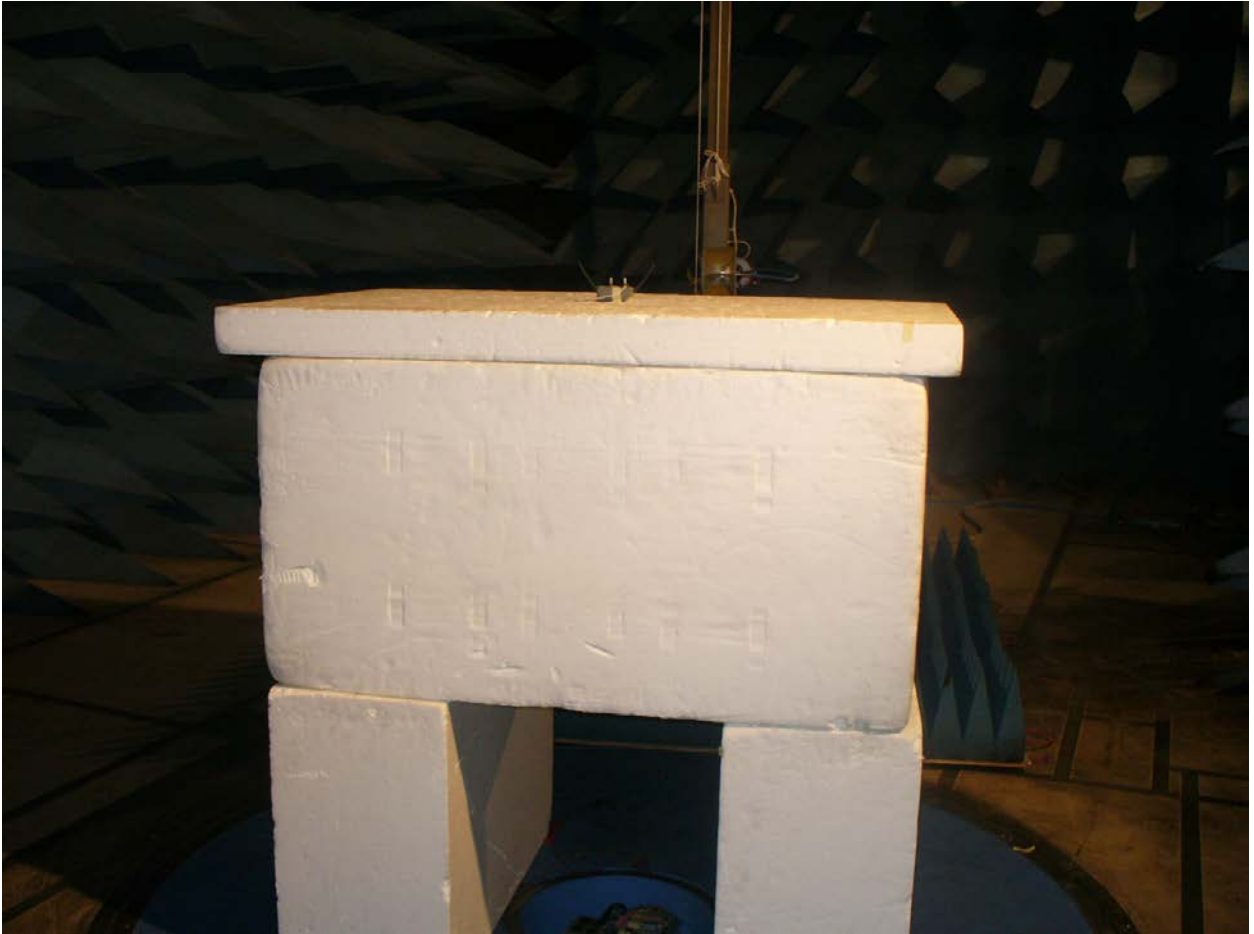
Figure 2: Radiated Emissions – Back View