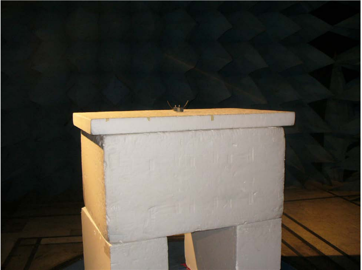
Figure 1: Radiated Emissions – Front View