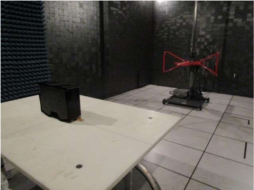
RADIATED EMISSIONS TEST SETUP 30-1000 MHZ 3 METER OATS