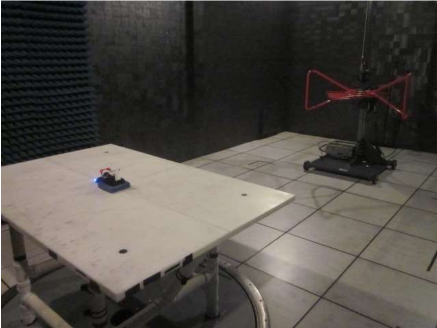
RADIATED EMISSIONS TEST SETUP 30-1000 MHZ 3 METER OATS