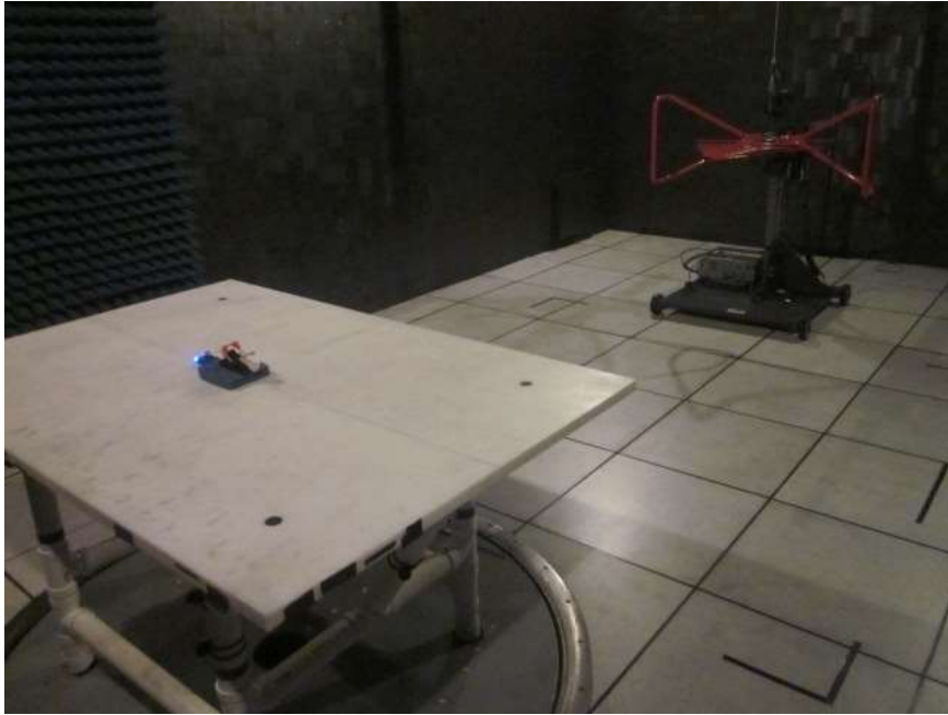
RADIATED EMISSIONS TEST SETUP 30-1000 MHZ 3 METER OATS