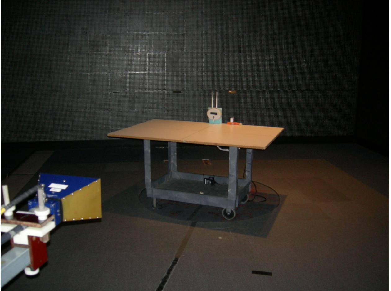
Figure 3: Radiated Emissions