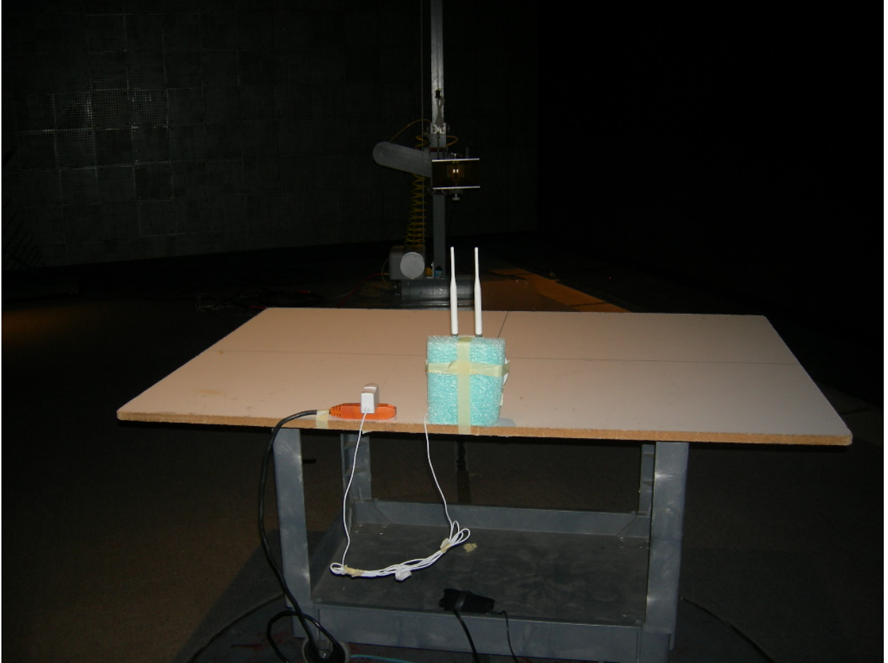
Figure 2: Radiated Emissions