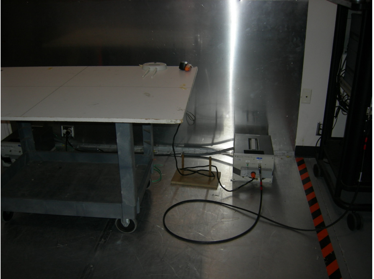
Figure 4: AC Power Line Conducted Emissions