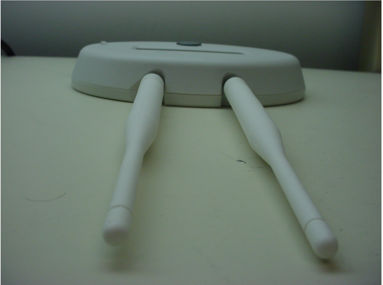
Figure 3: Top View