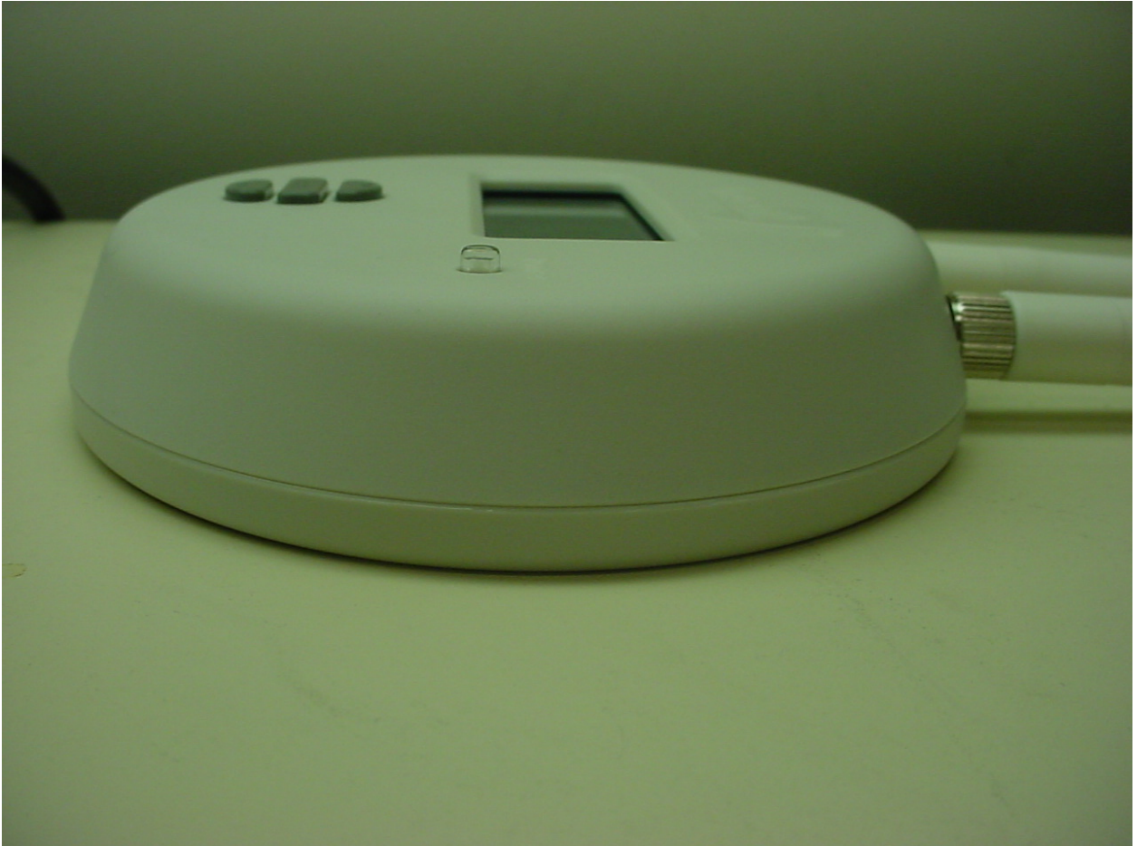
Figure 5: Side View