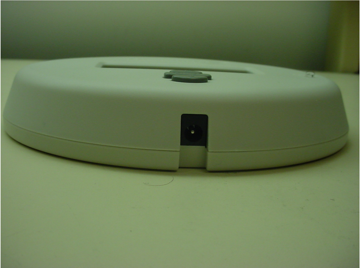
Figure 4: Bottom View