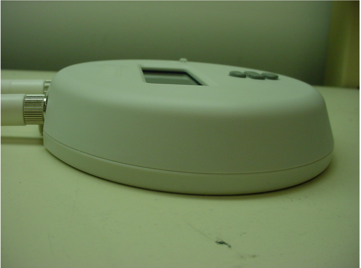
Figure 6: Side View