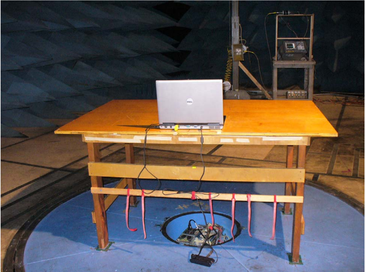
Figure 2: Radiated Emissions – Back View