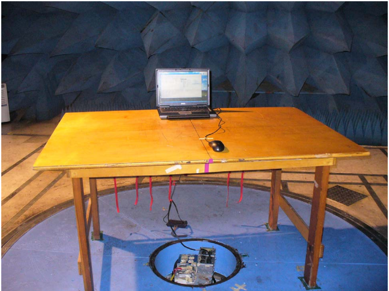
Figure 1: Radiated Emissions – Front View