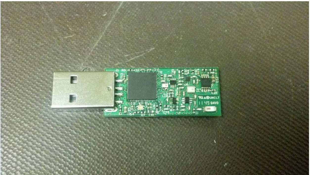
Figure 1: RF Board – Top View