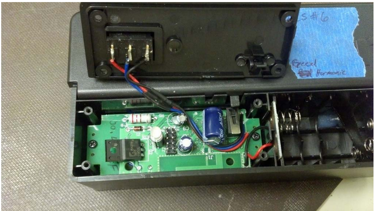
Figure 3: M250RF – Internal View