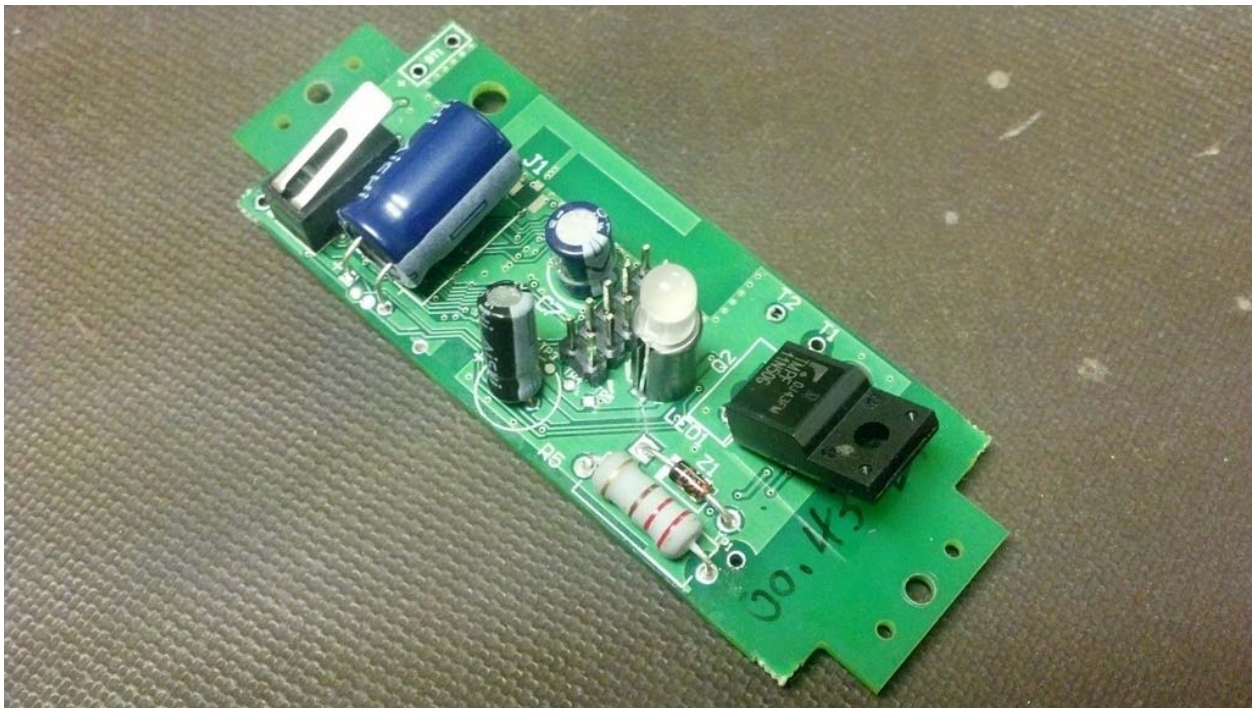
Figure 1: PCB – Top View