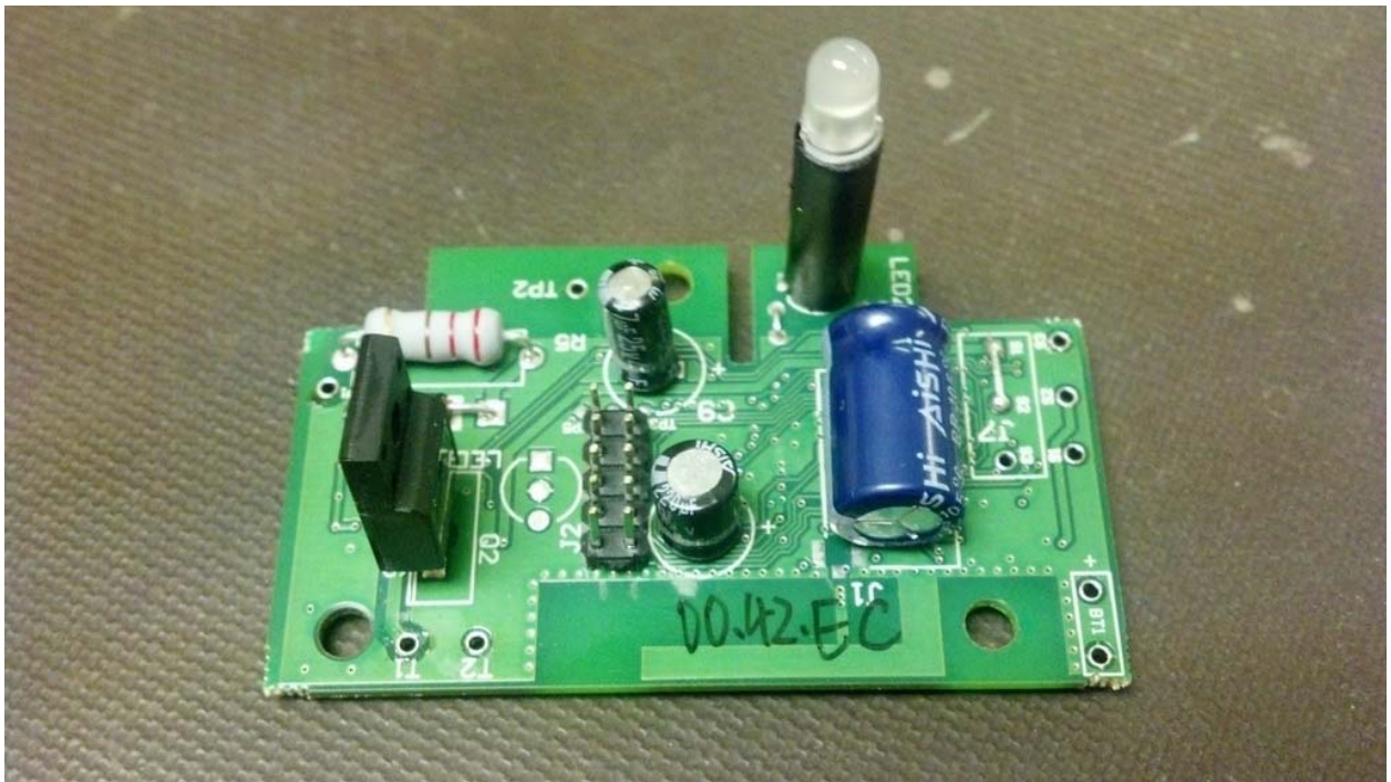
Figure 1: PCB – Top View