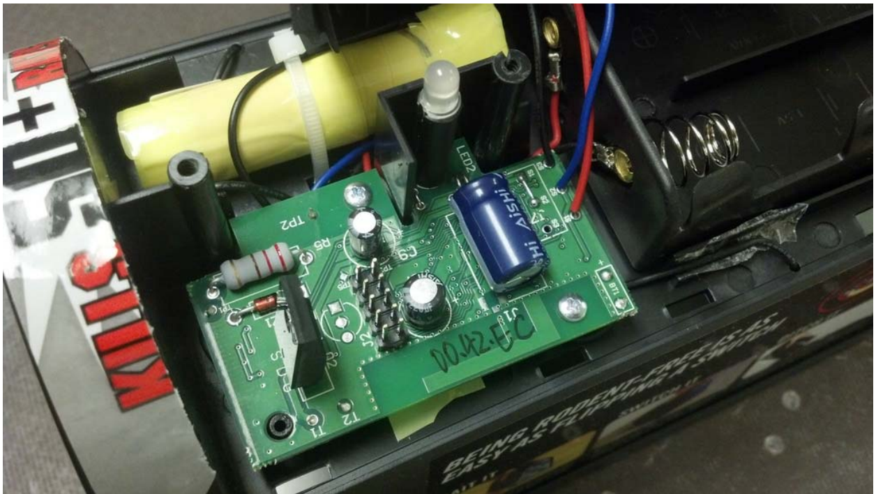
Figure 3: M240RF – Internal View