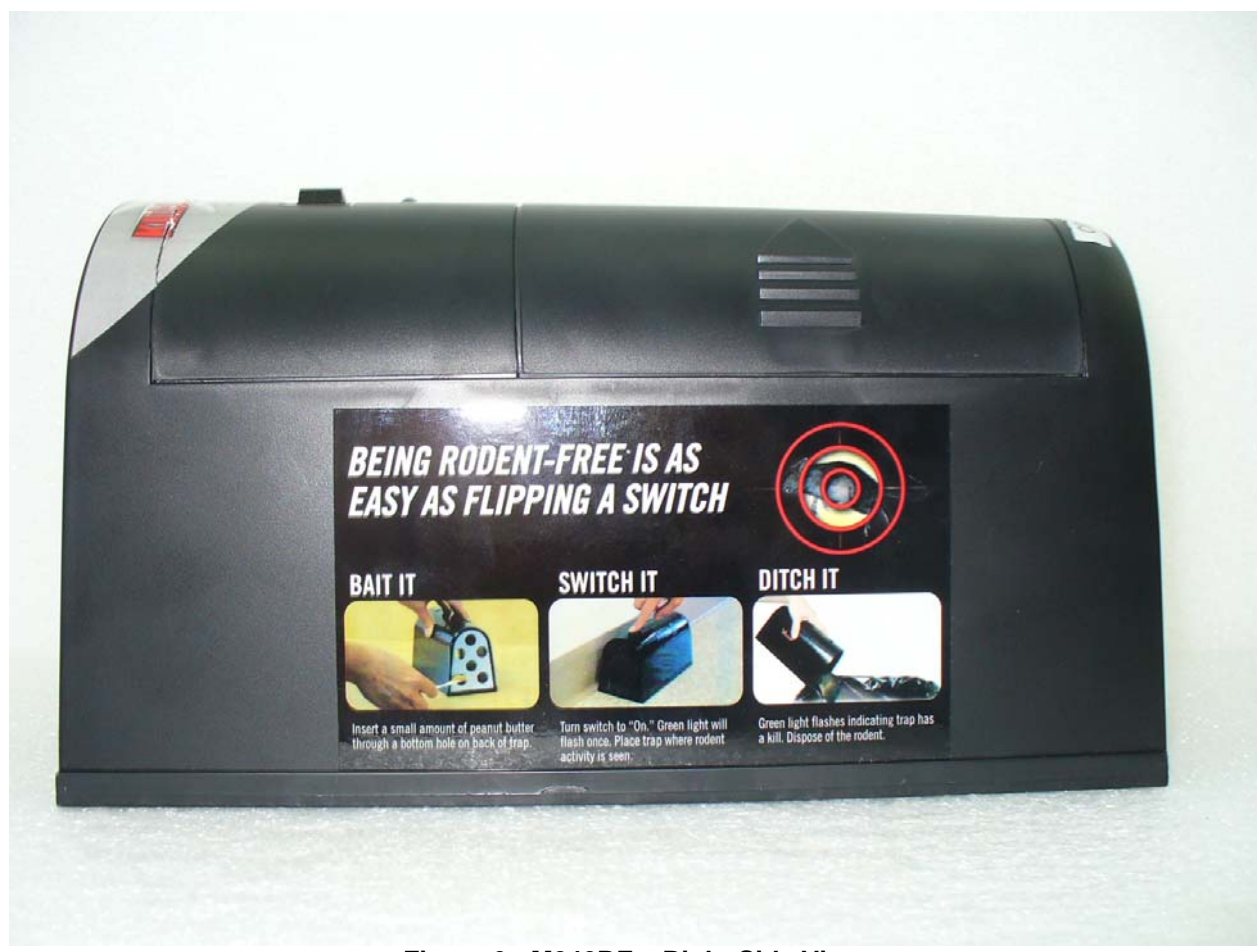
Figure 6: M240RF – Right Side View