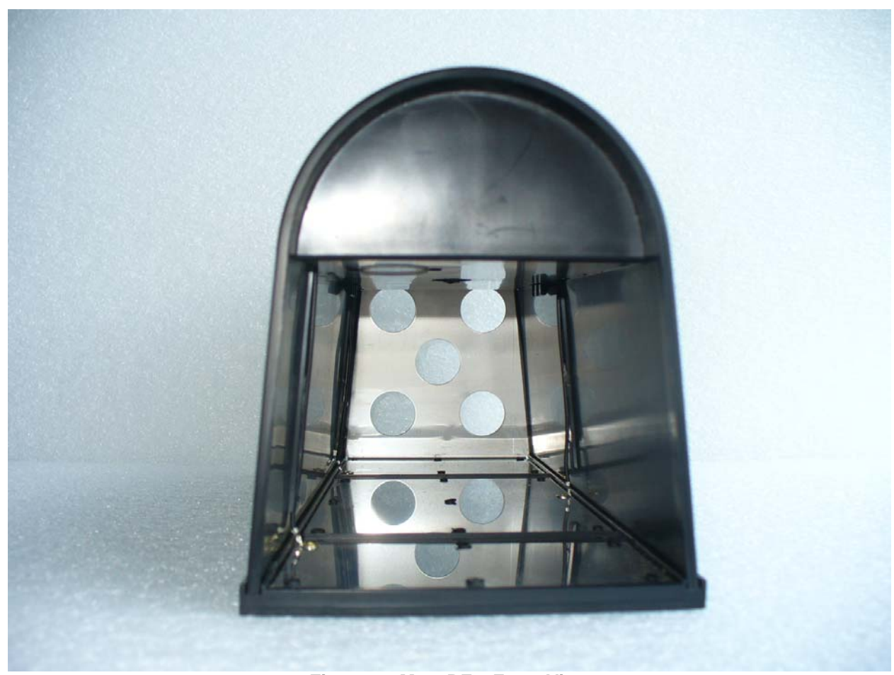
Figure 1: M240RF - Front View