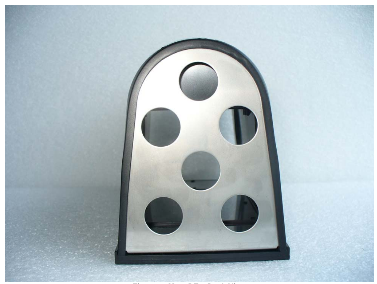
Figure 2: M240RF - Back View