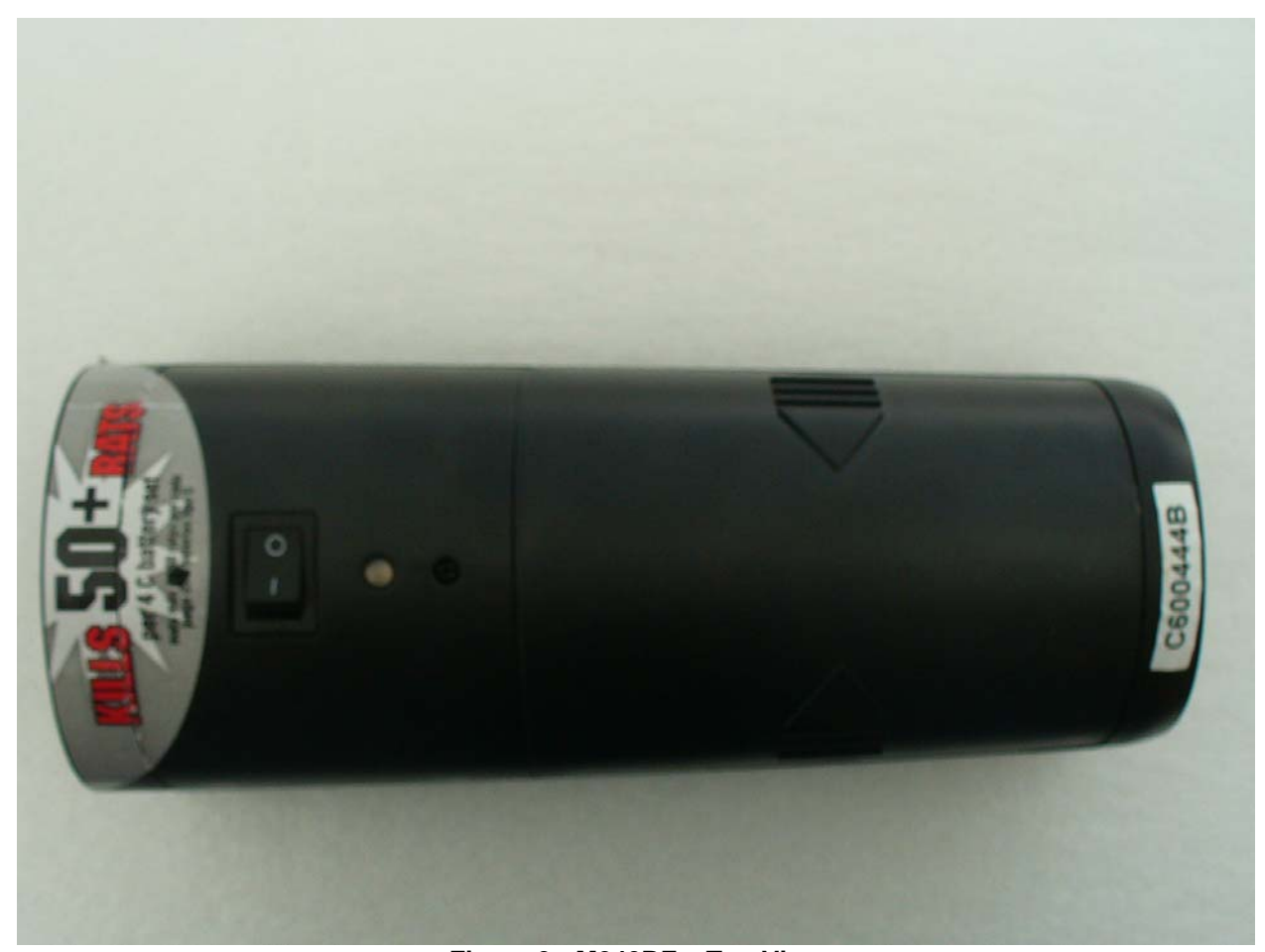
Figure 3: M240RF - Top View