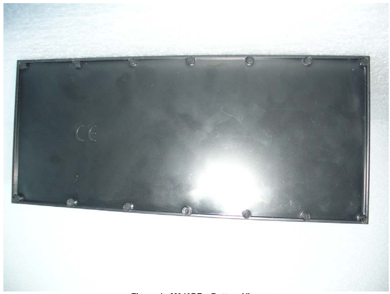
Figure 4: M240RF - Bottom View