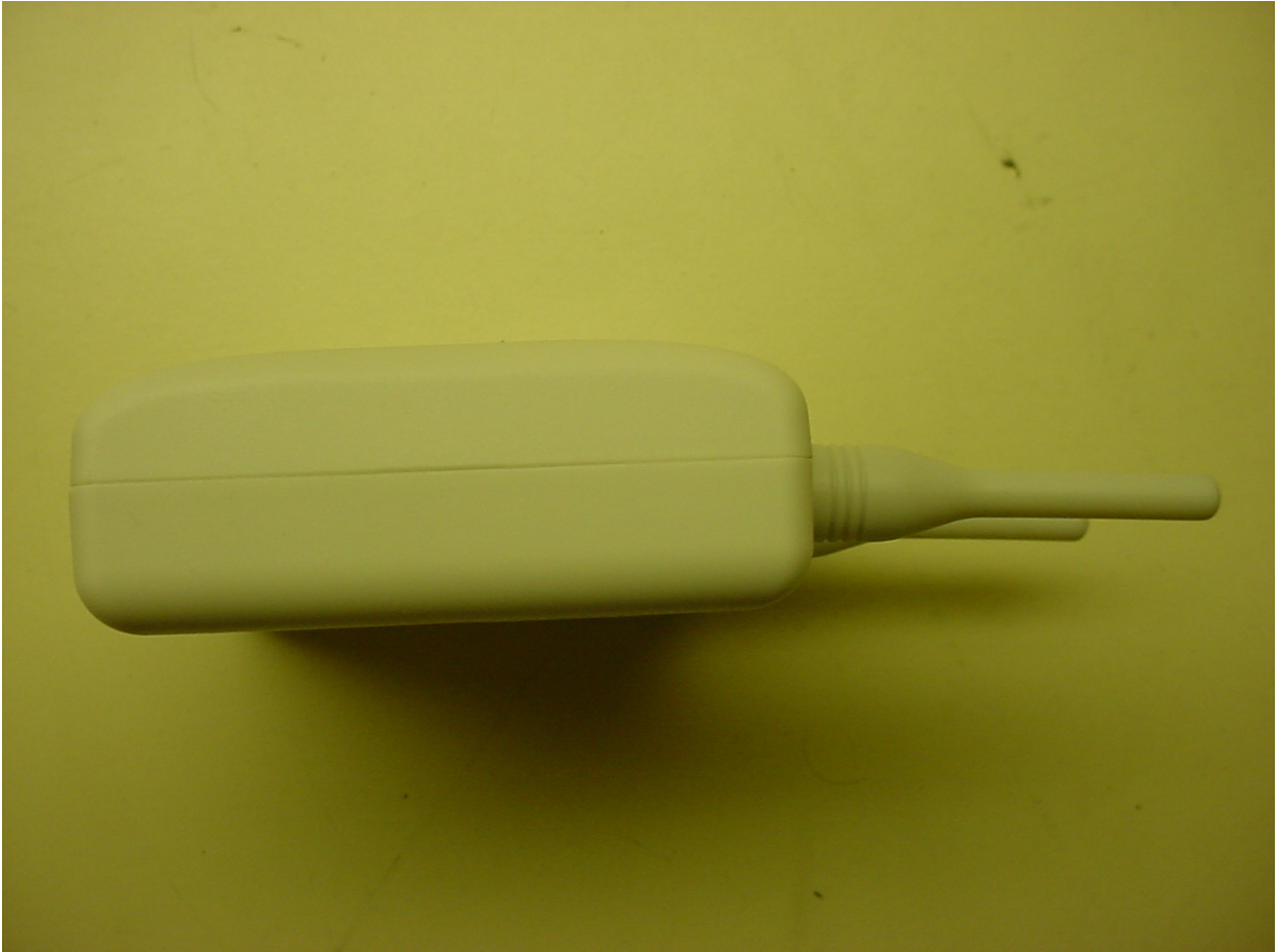
Figure 6: Side View