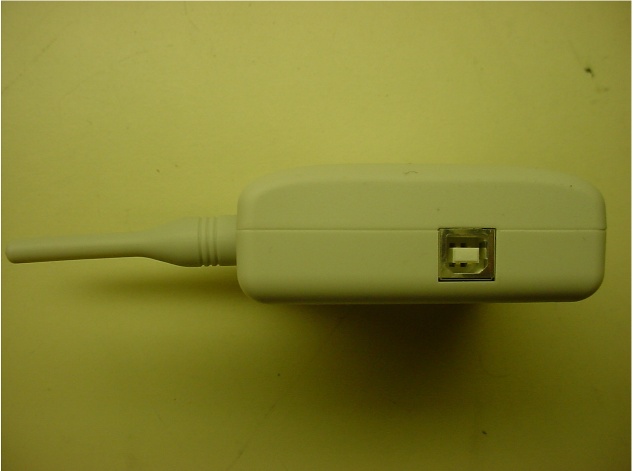
Figure 5: Side View