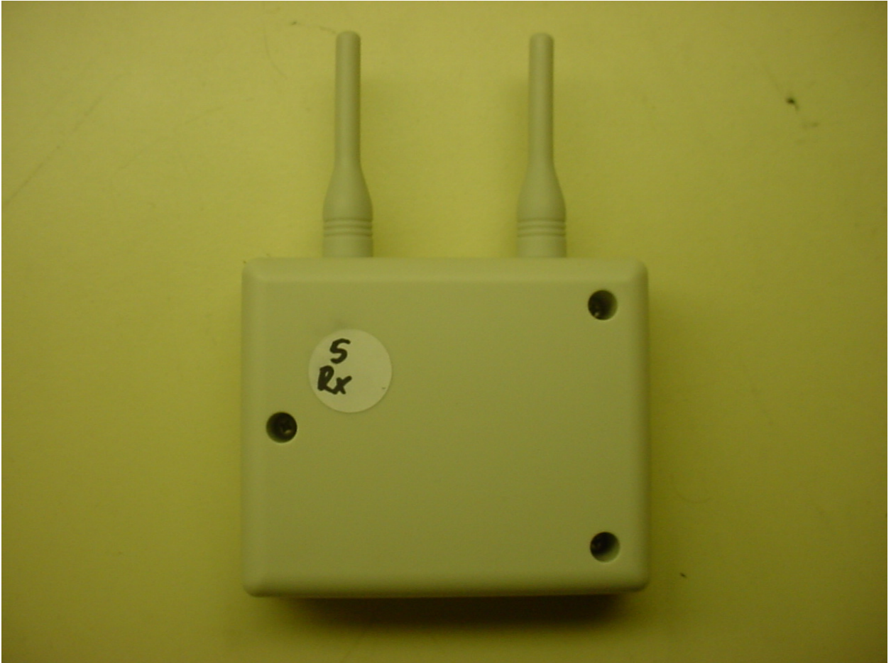
Figure 2: Back View