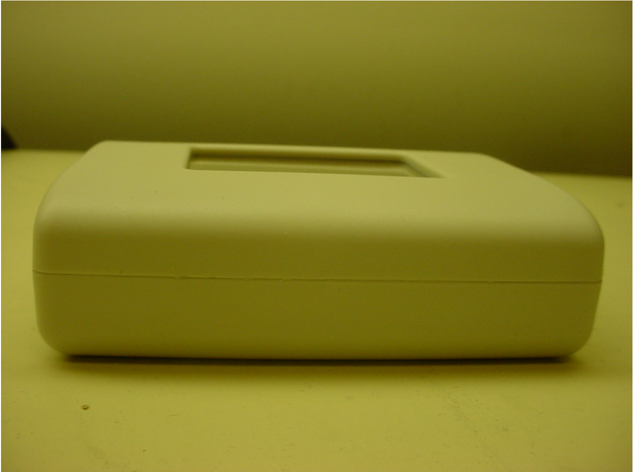
Figure 4: Bottom View