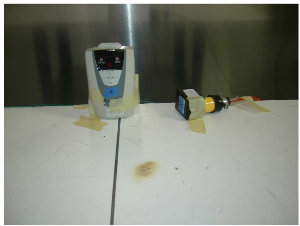
Figure 3: Conducted Emissions – Front View