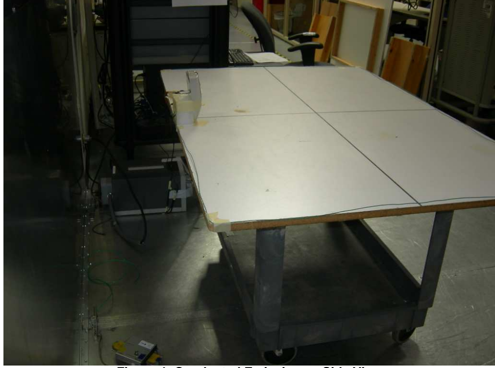
Figure 4: Conducted Emissions - Side View