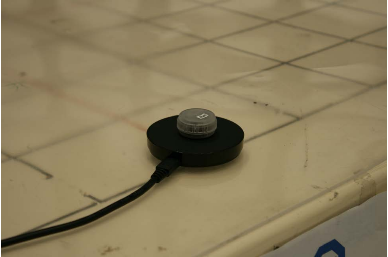
Radiated Emissions Test Setup