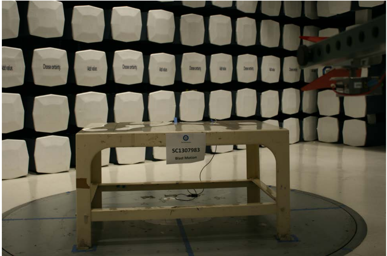
Radiated Emissions Test Setup (above 1GHz)