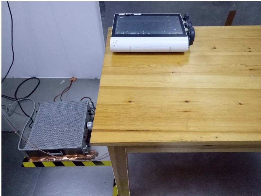
Test Photo 1