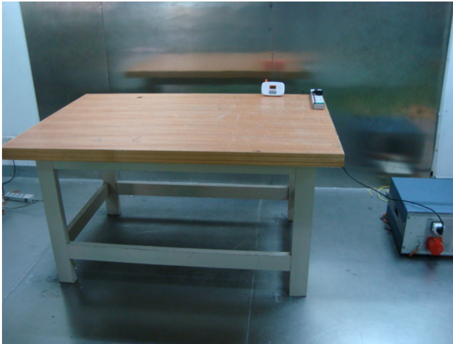
AC Line Conducted Emissions - Side View (Adapter Mode)