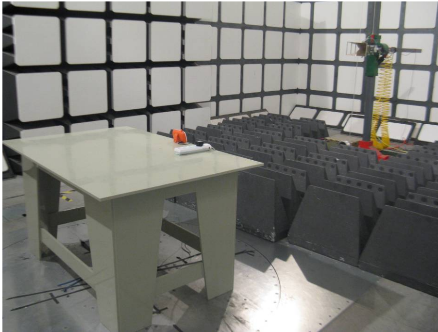
Above 1 GHz: Radiated Emissions - Rear View (Adapter Mode)