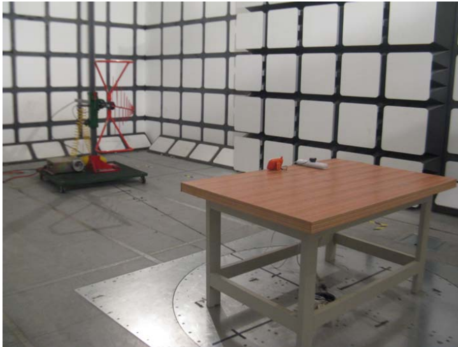
Below 1 GHz: Radiated Emissions - Rear View (Adapter Mode)