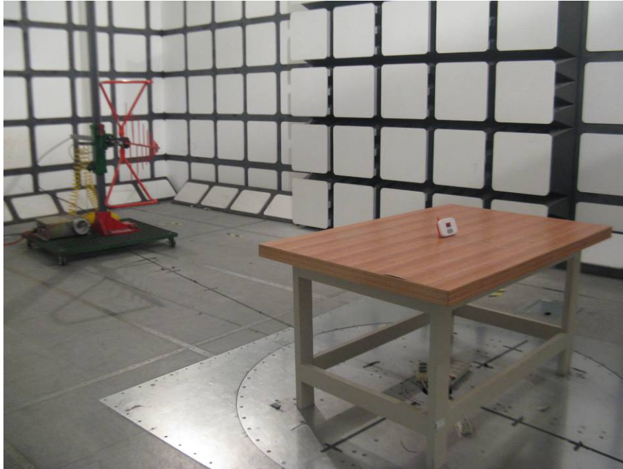
Below 1 GHz: Radiated Emissions - Rear View (Battery Mode)