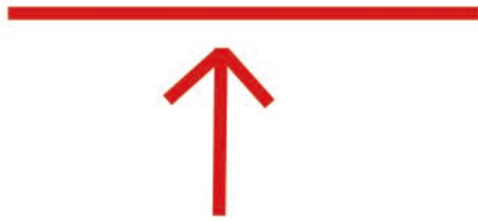
On the bottom side Size: 92mm x 55mm