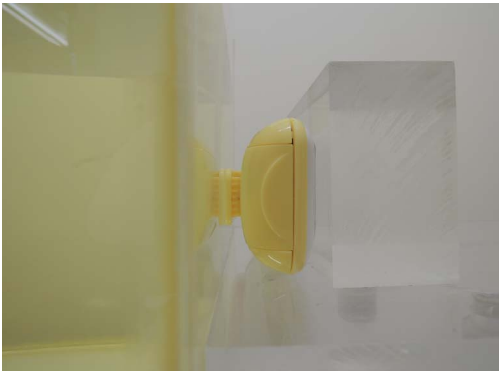
Back Surface, 0mm separation