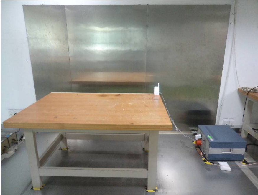
Conduction Emissions - Side View