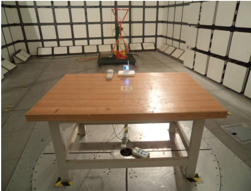
Radiated Emissions – Rear View (30-1000 MHz)