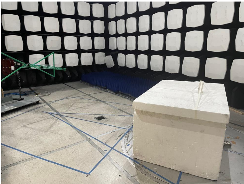
Figure 2: Test Setup – Radiated Emissions <1GHz