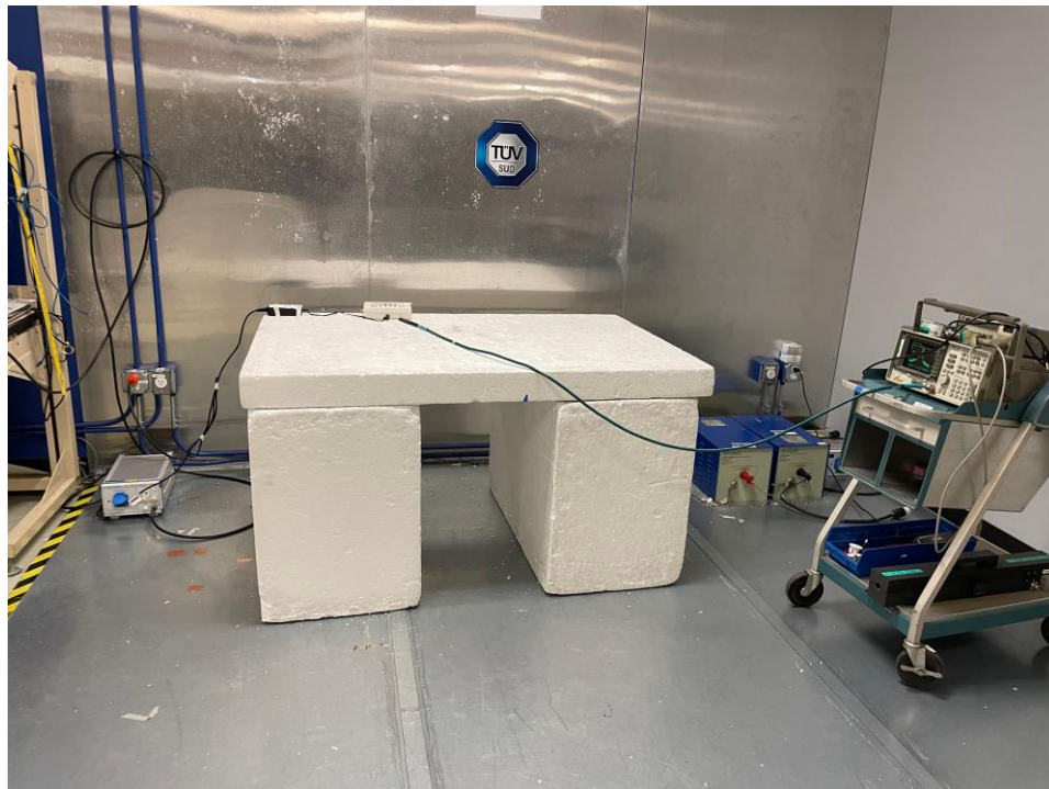
Figure 5: Test Setup – AC Power Line Conducted Emissions