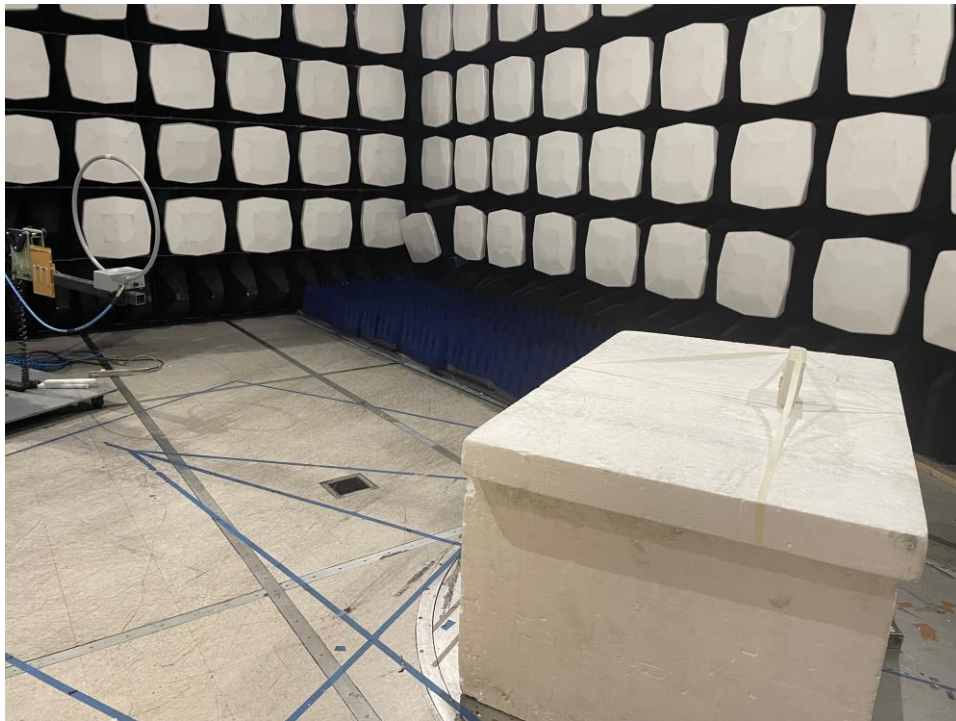
Figure 1: Test Setup – Radiated Emissions <30MHz