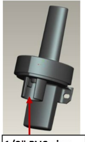
1/2" PVC pipe

Never hammer MiNode-Water6 onto the stake since this may result in damage to the electronic components inside the unit.