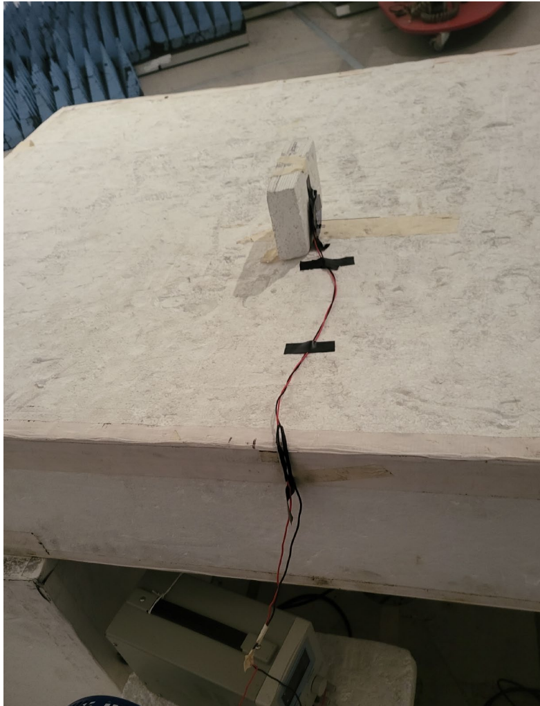
Figure 1. Radiated Emissions Test Setup