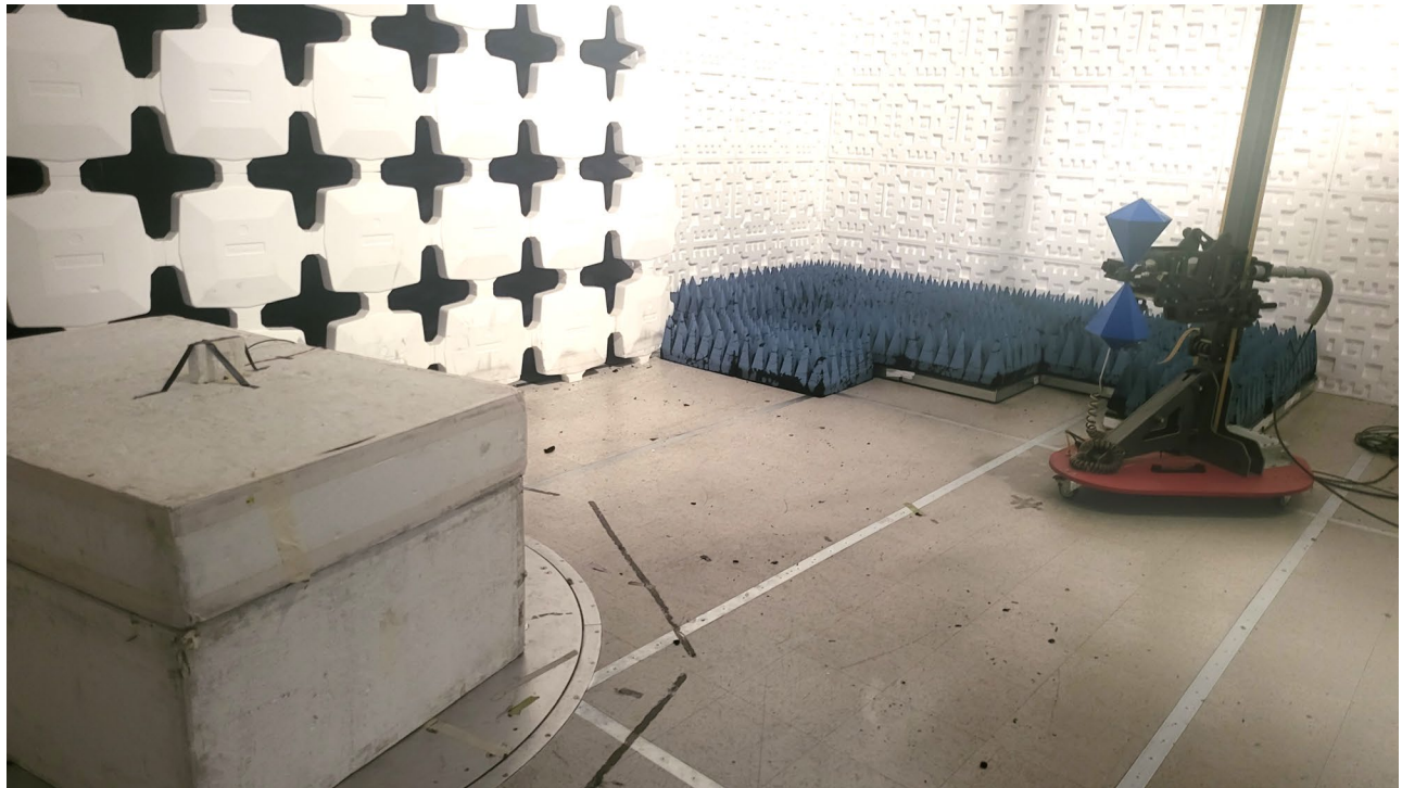
Figure 3. Radiated Emissions Test Setup (30 - 1000 MHz)

FCC Part 15 Certification/ RSS 210 SM6-MINODE6A 9235A -MINODE6A 24-0031 March 19, 2024 Mueller Systems, LLC MINODE6A