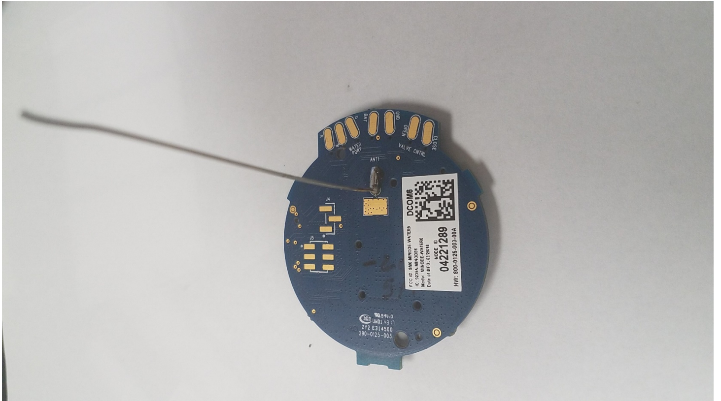
Figure 3: Bottom View with Antenna