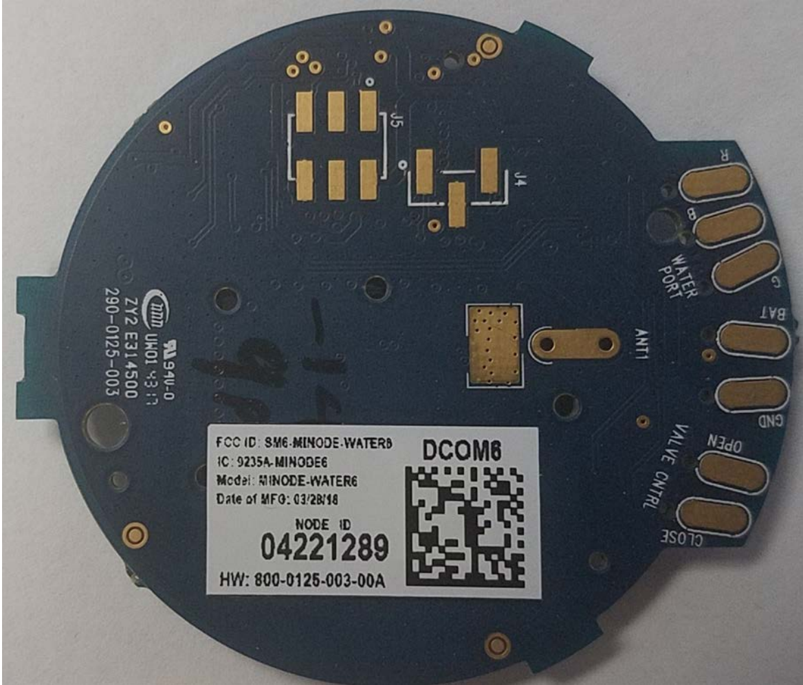
Figure 2: Label Location - Affixed to back side of PCBA as shown below: